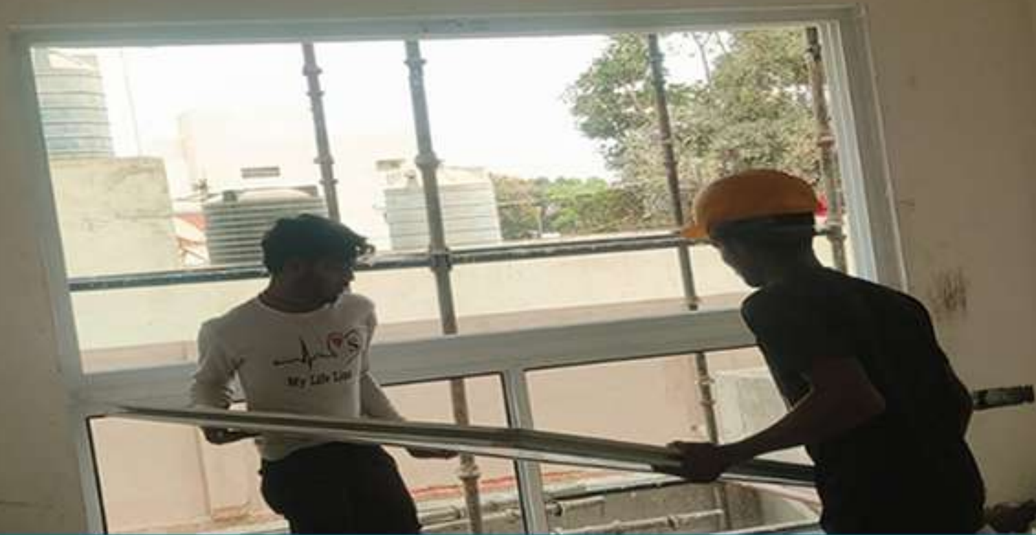
A-Block Cluster-01 UPVC Fixing work in progress