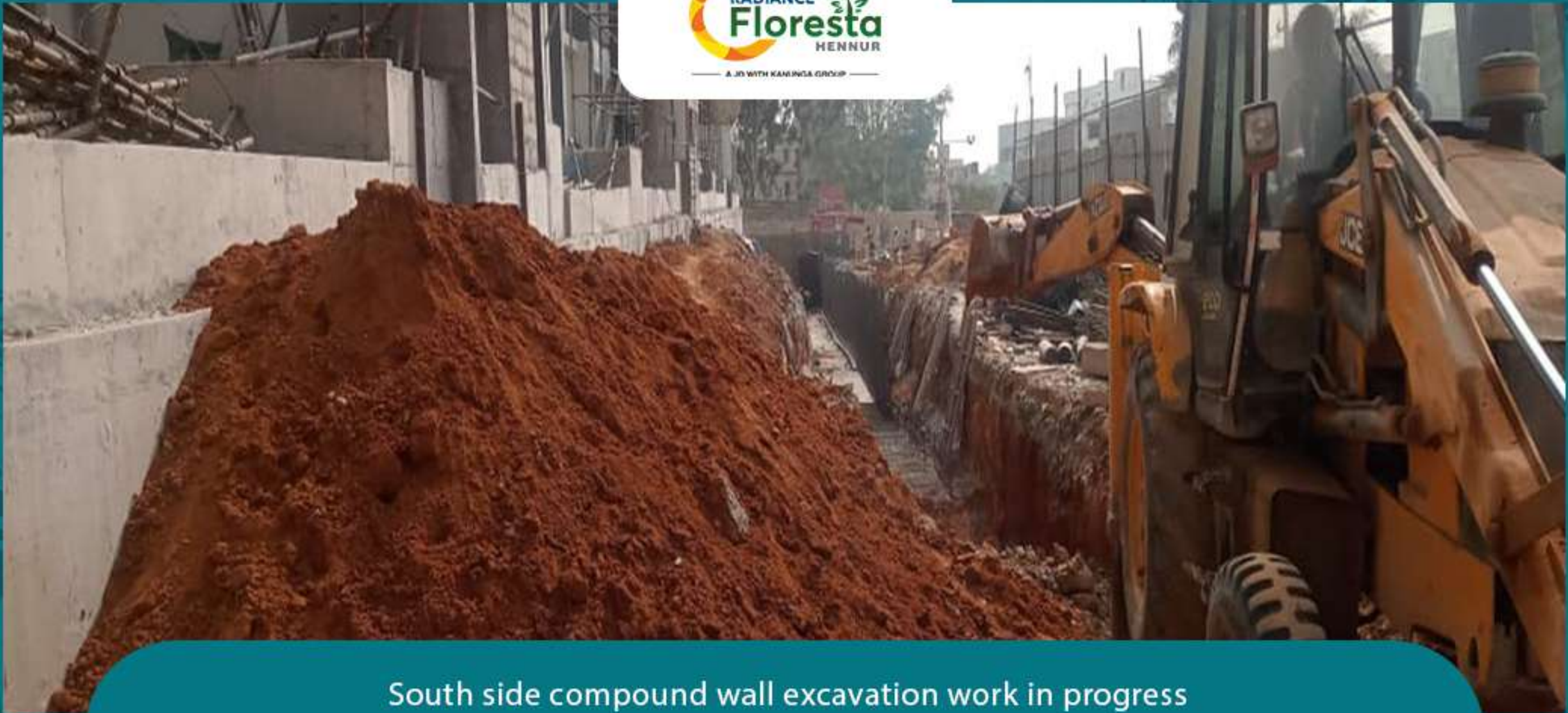
South side compound wall excavation work in progress