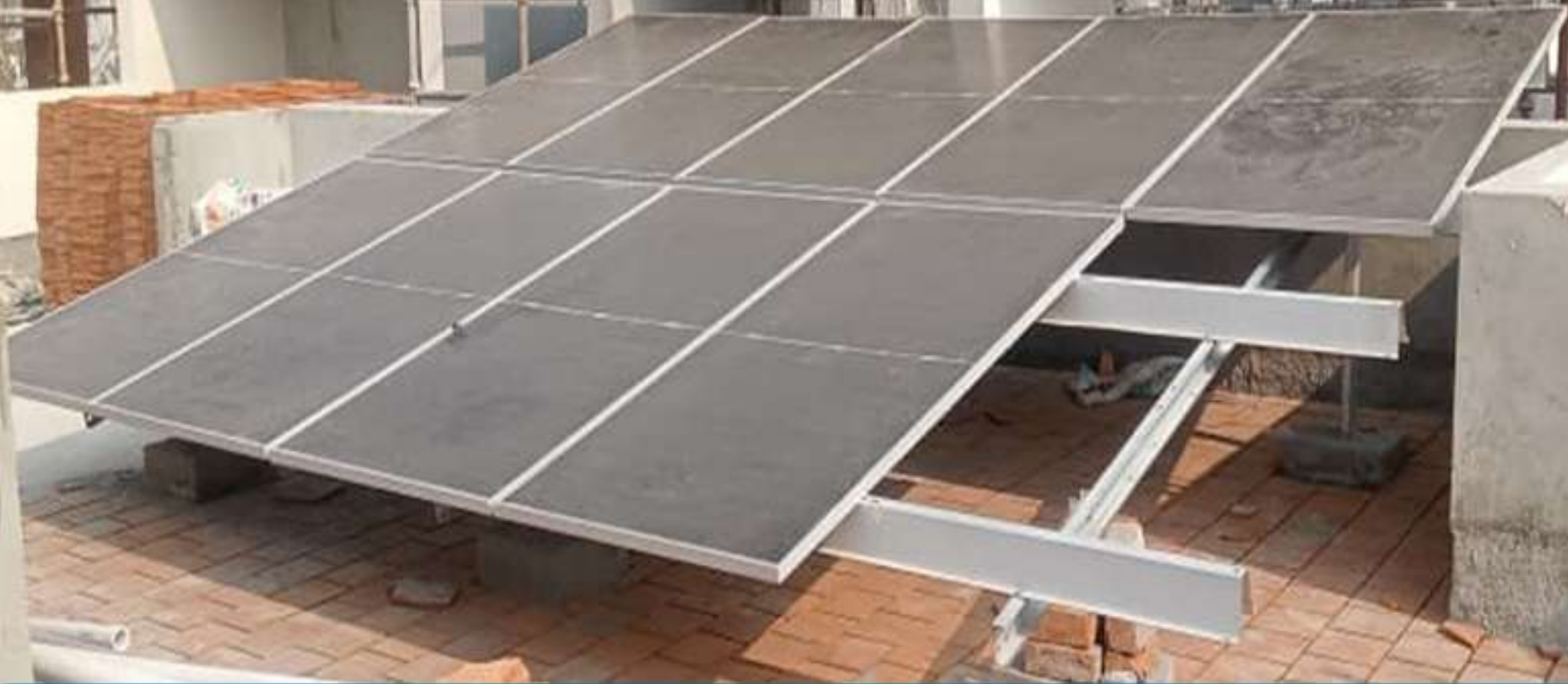
B-Block Solar panel work in progress