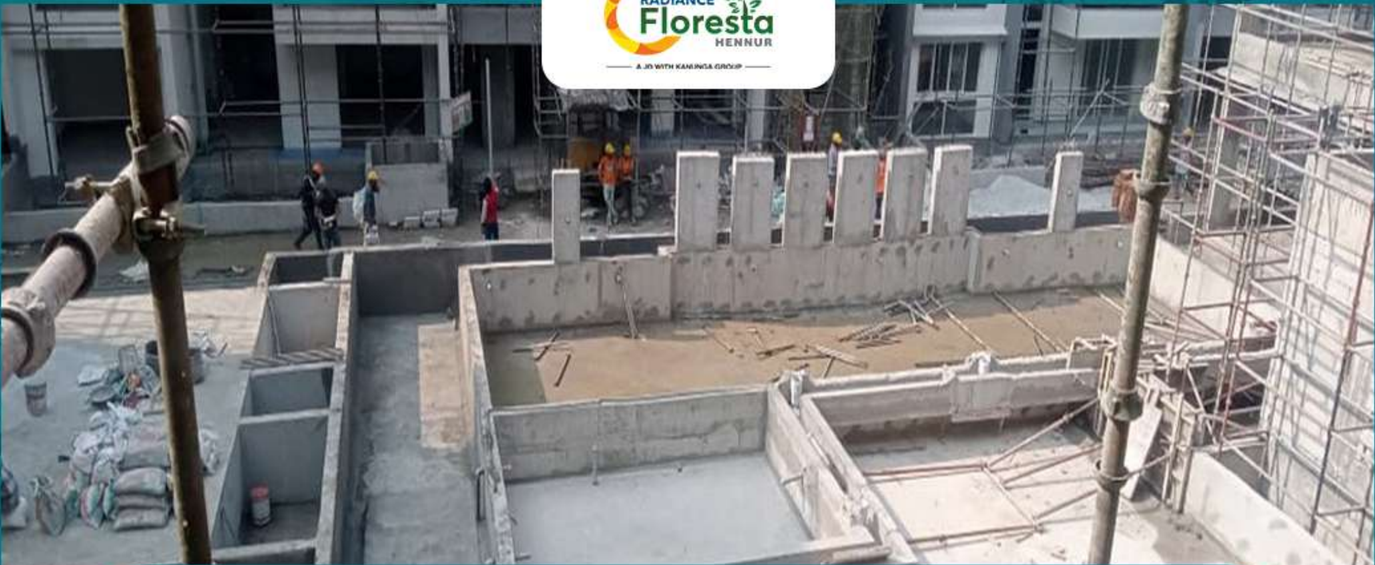
Swimming Pool and Planter box water proofing work in progress