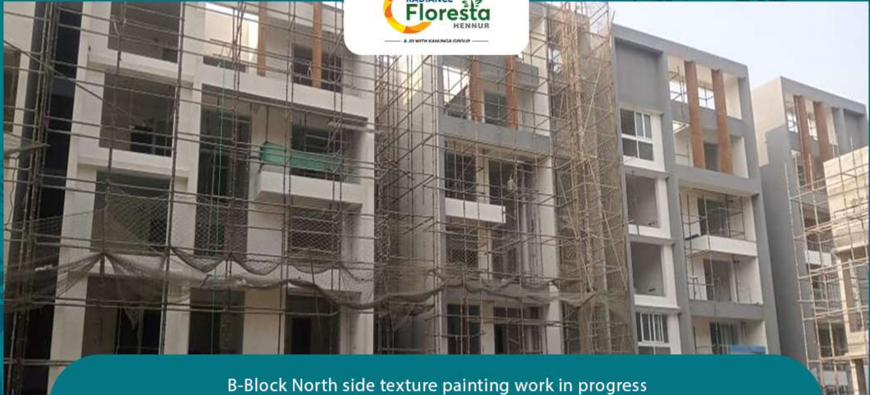
B-Block North side texture painting work in progress