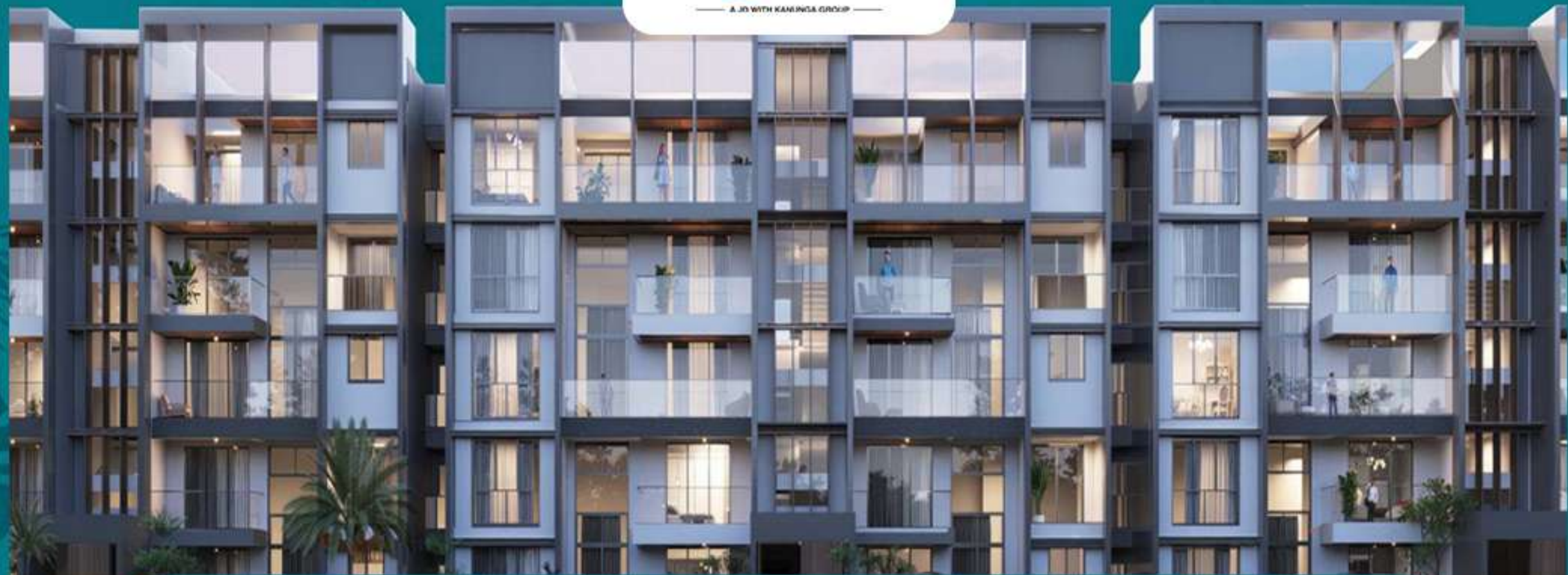
B-Block South side Elevation