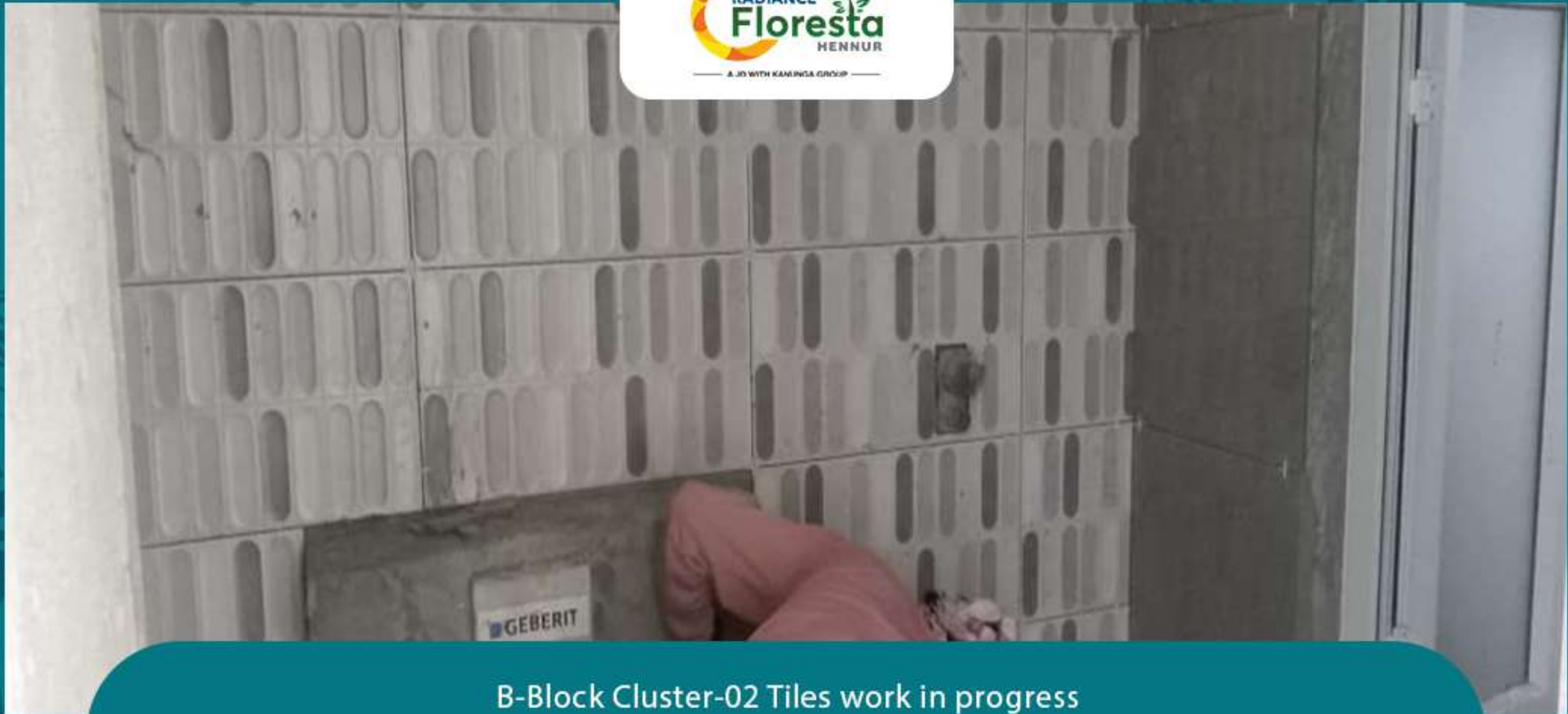
B-Block Cluster-02 Tiles work in progress