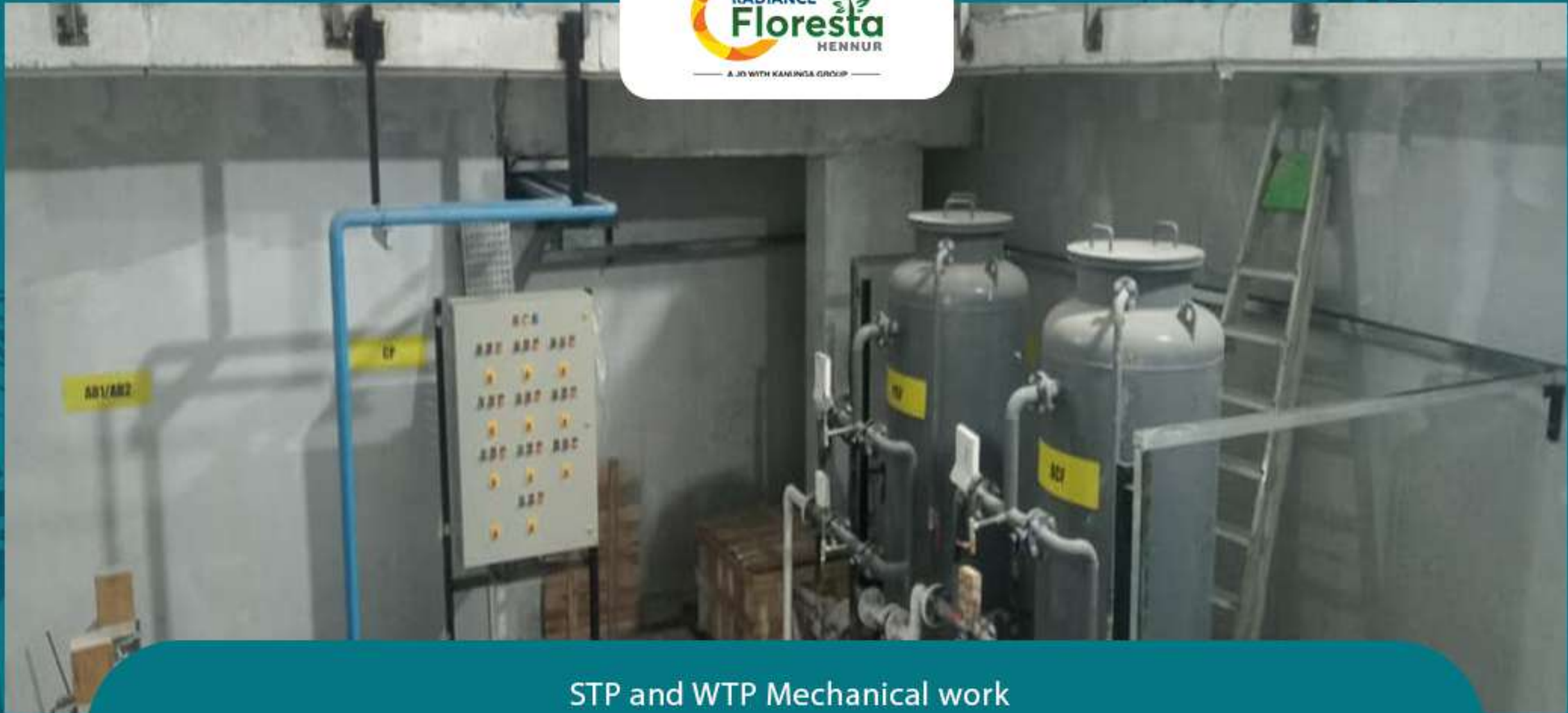
STP and WTP Mechanical work