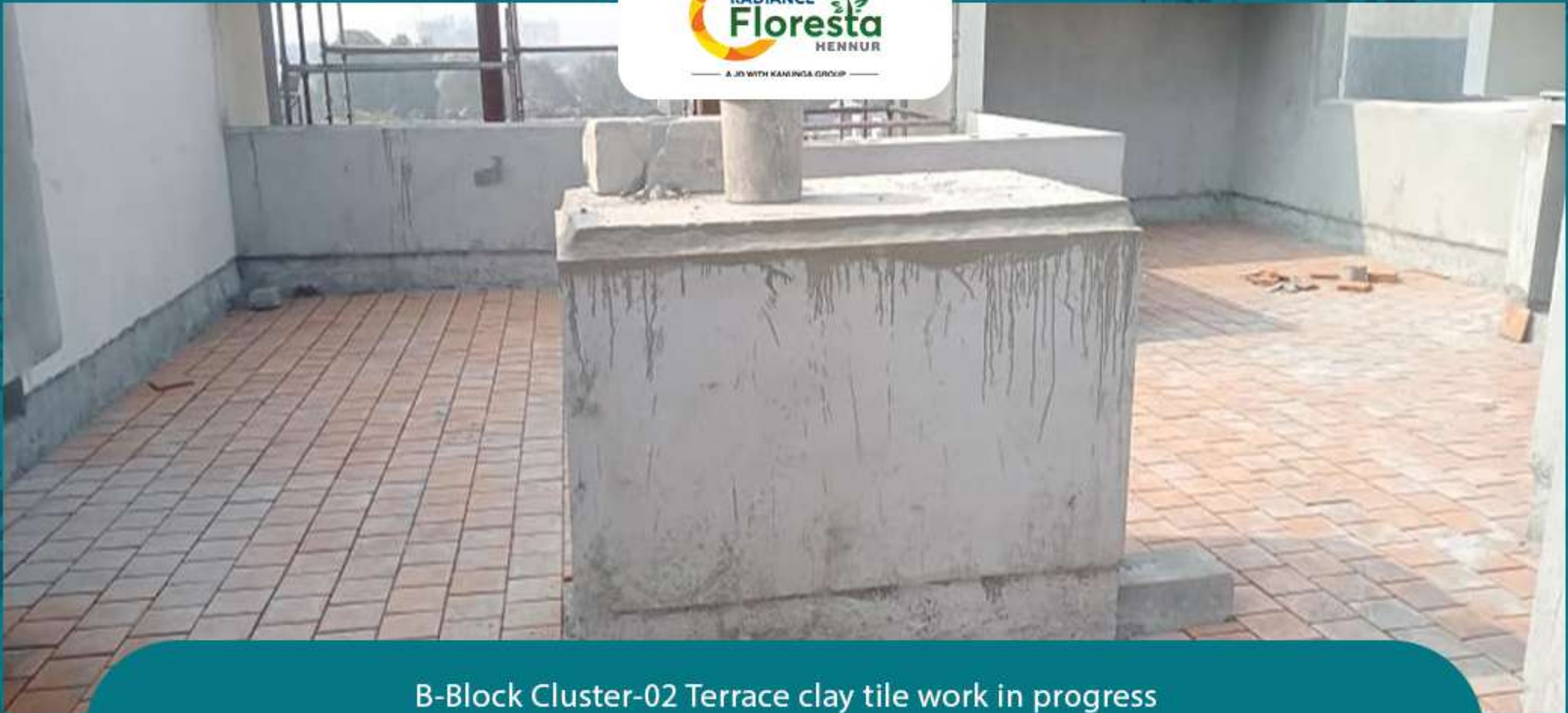
B-Block Cluster-02 Terrace clay tile work in progress