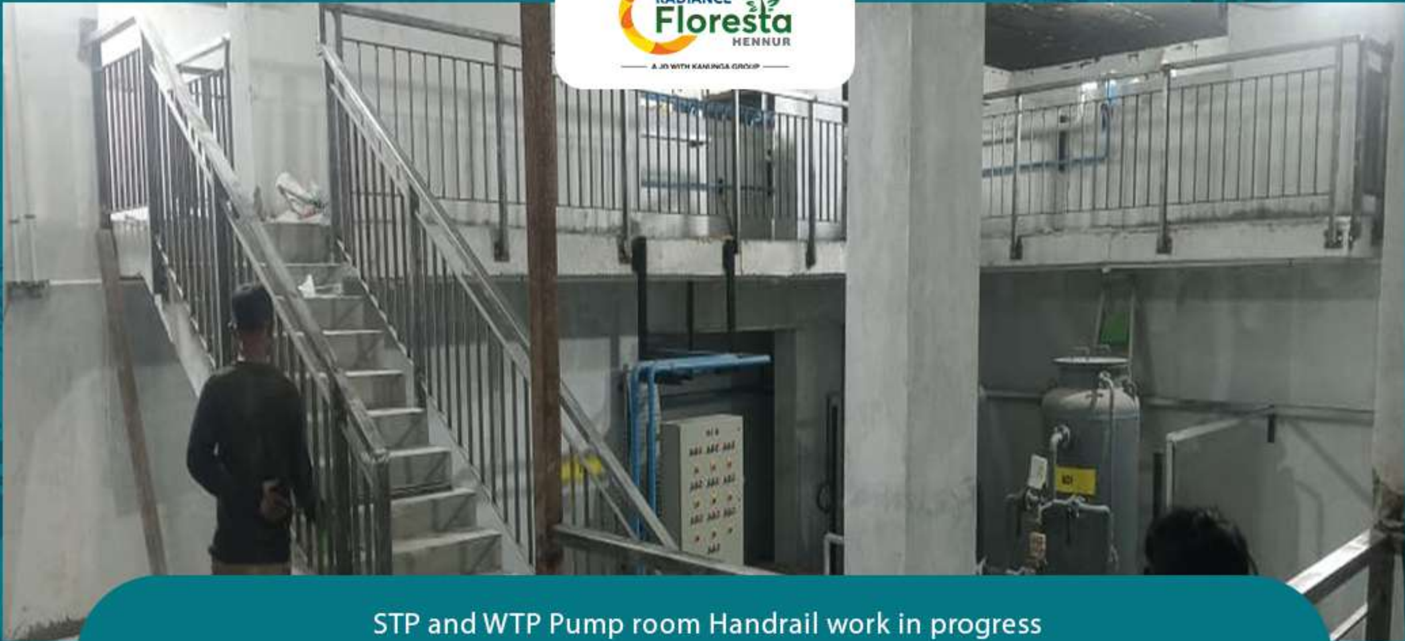
STP and WTP Pump room Handrail work in progress