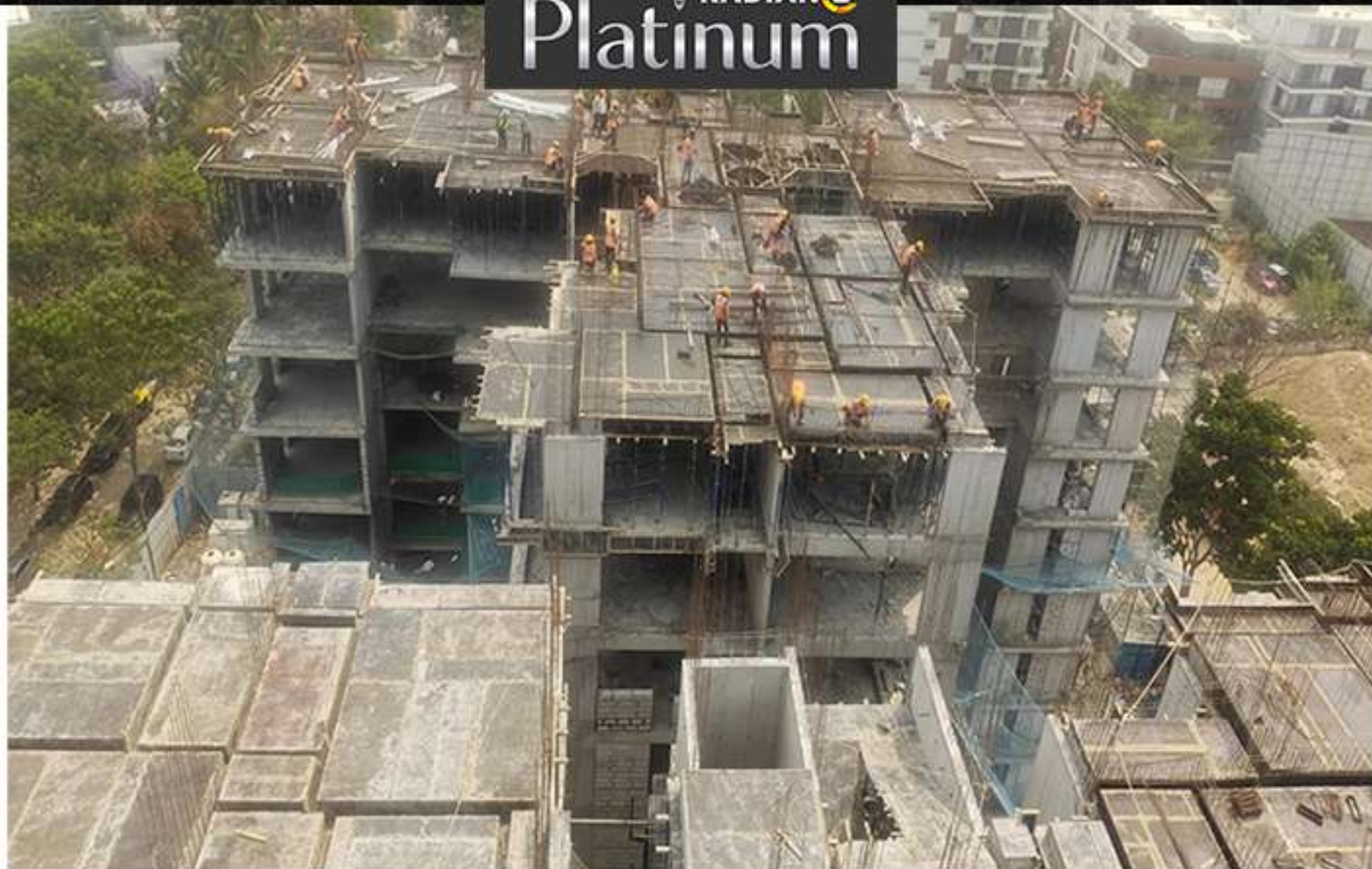
Block - B - 9th Floor Roof Slab - B1003, B1004 & B1005