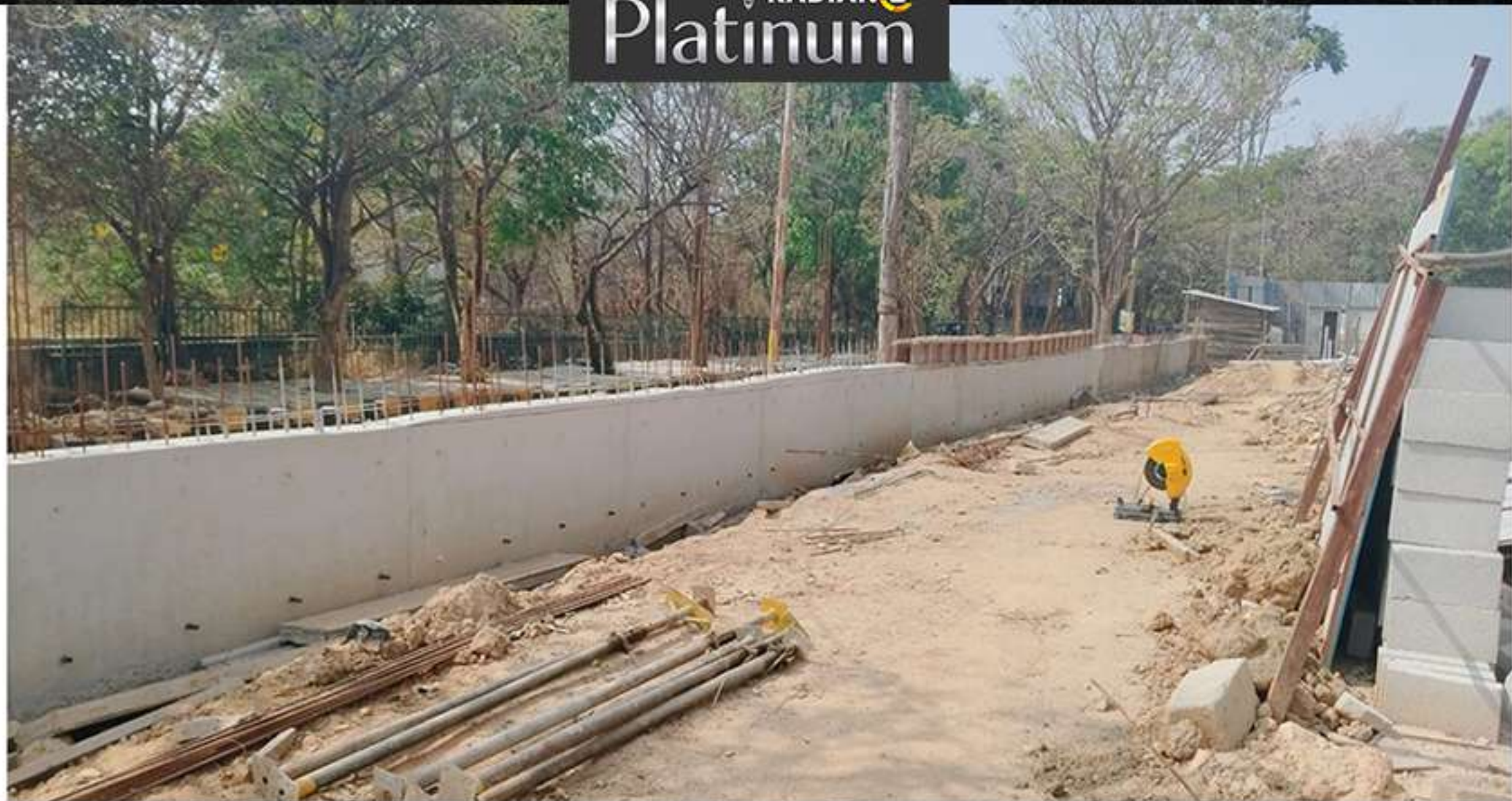
Compound Wall - East Side