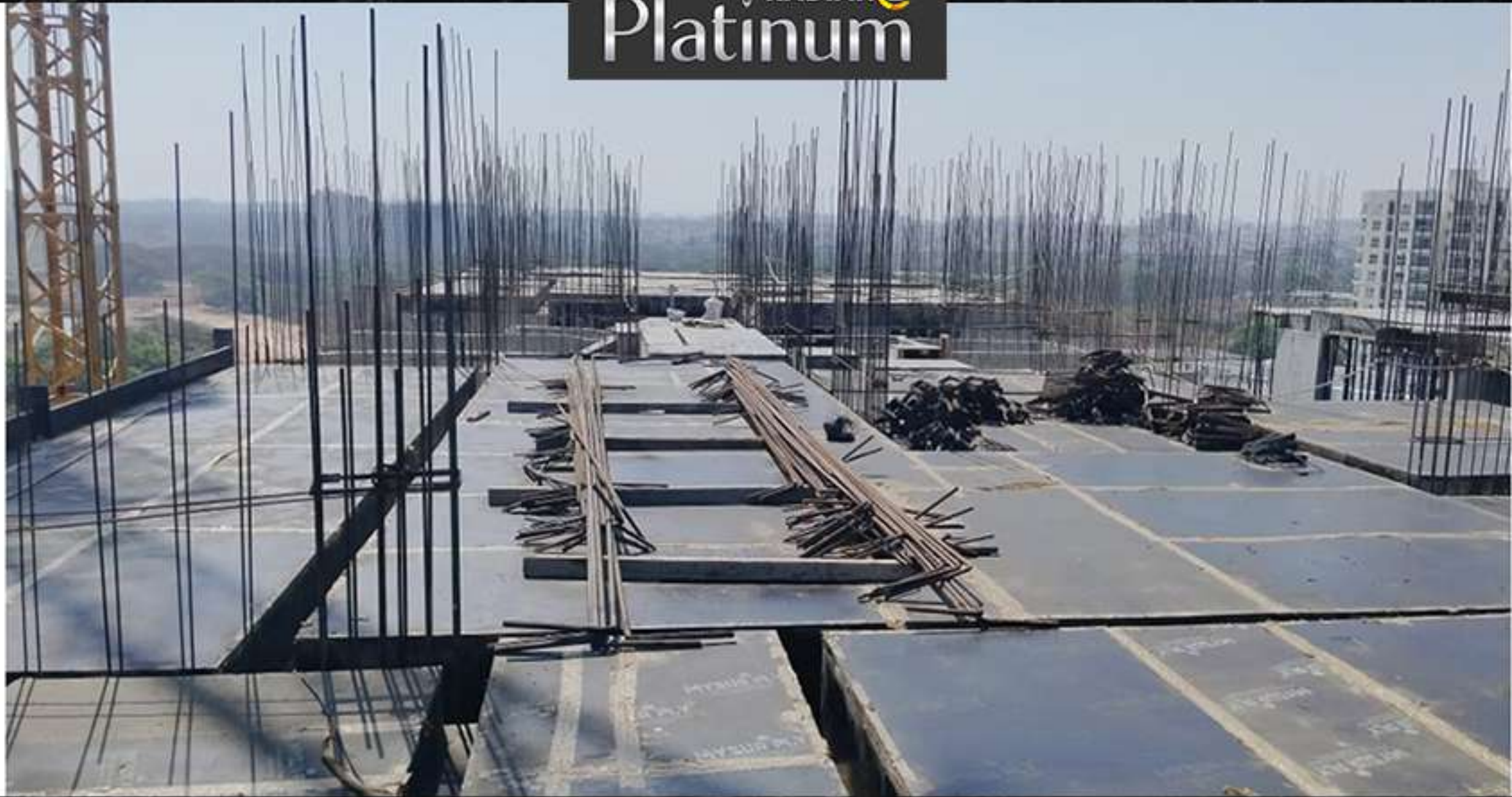
Block A - 9th Floor Roof Slab Reinforcement Work (A1001,A1002)