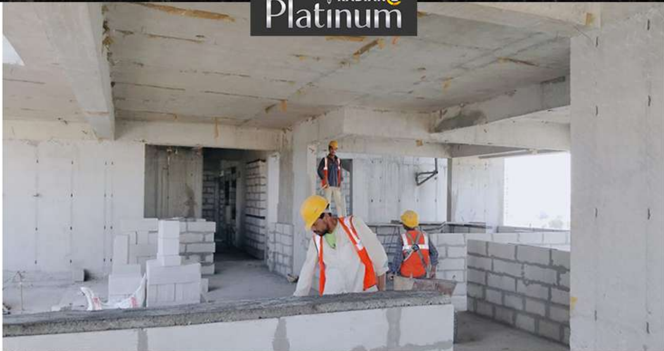
7th Floor Block Work