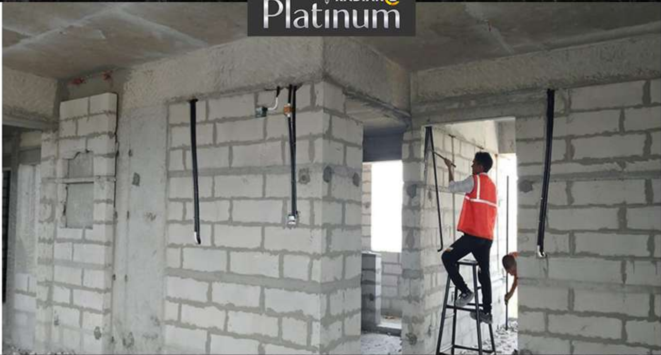
4th Floor Electrical Work