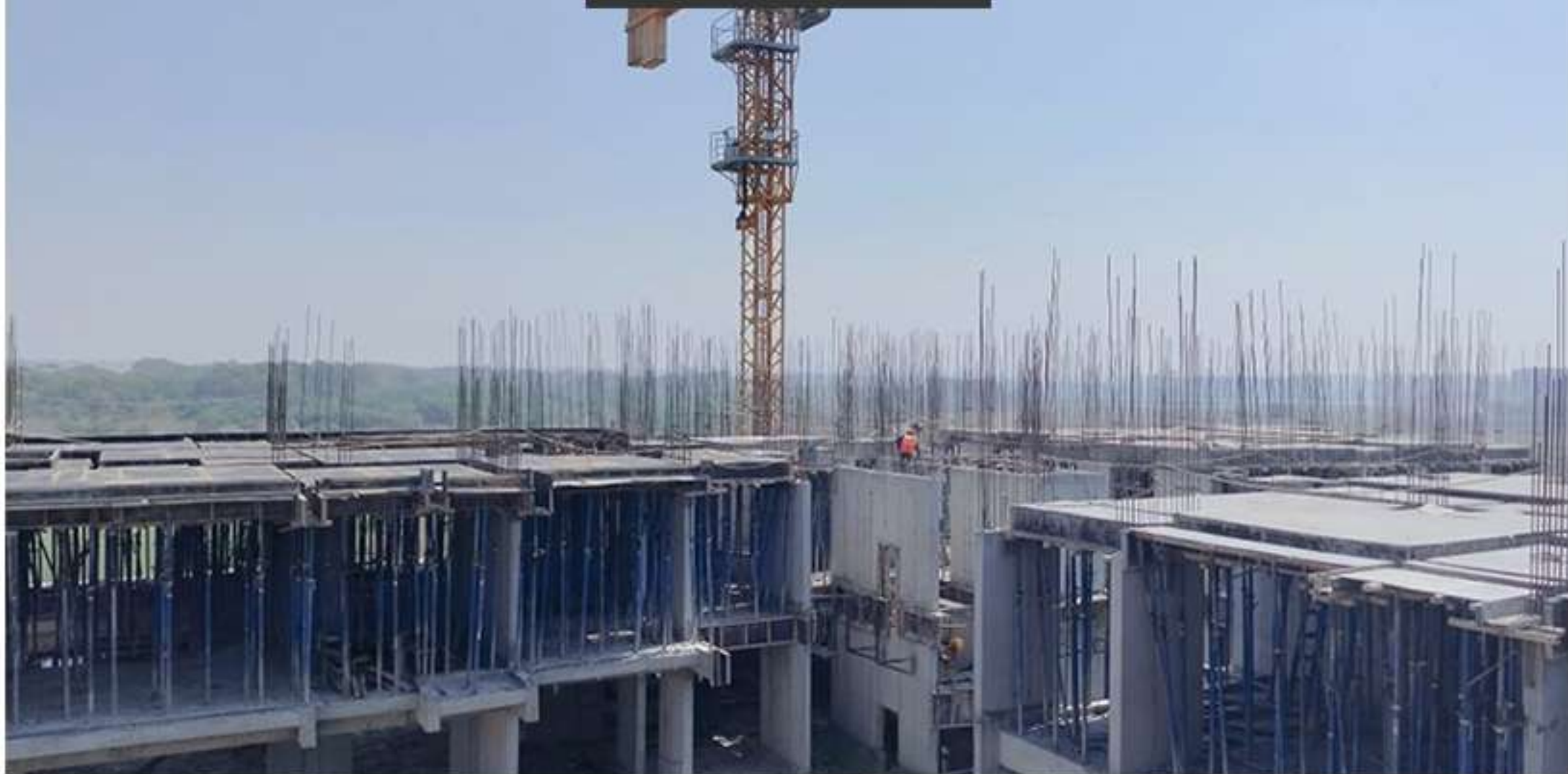
Block A - 9th Floor Roof Slab Reinforcement Work (A1001,A1002)