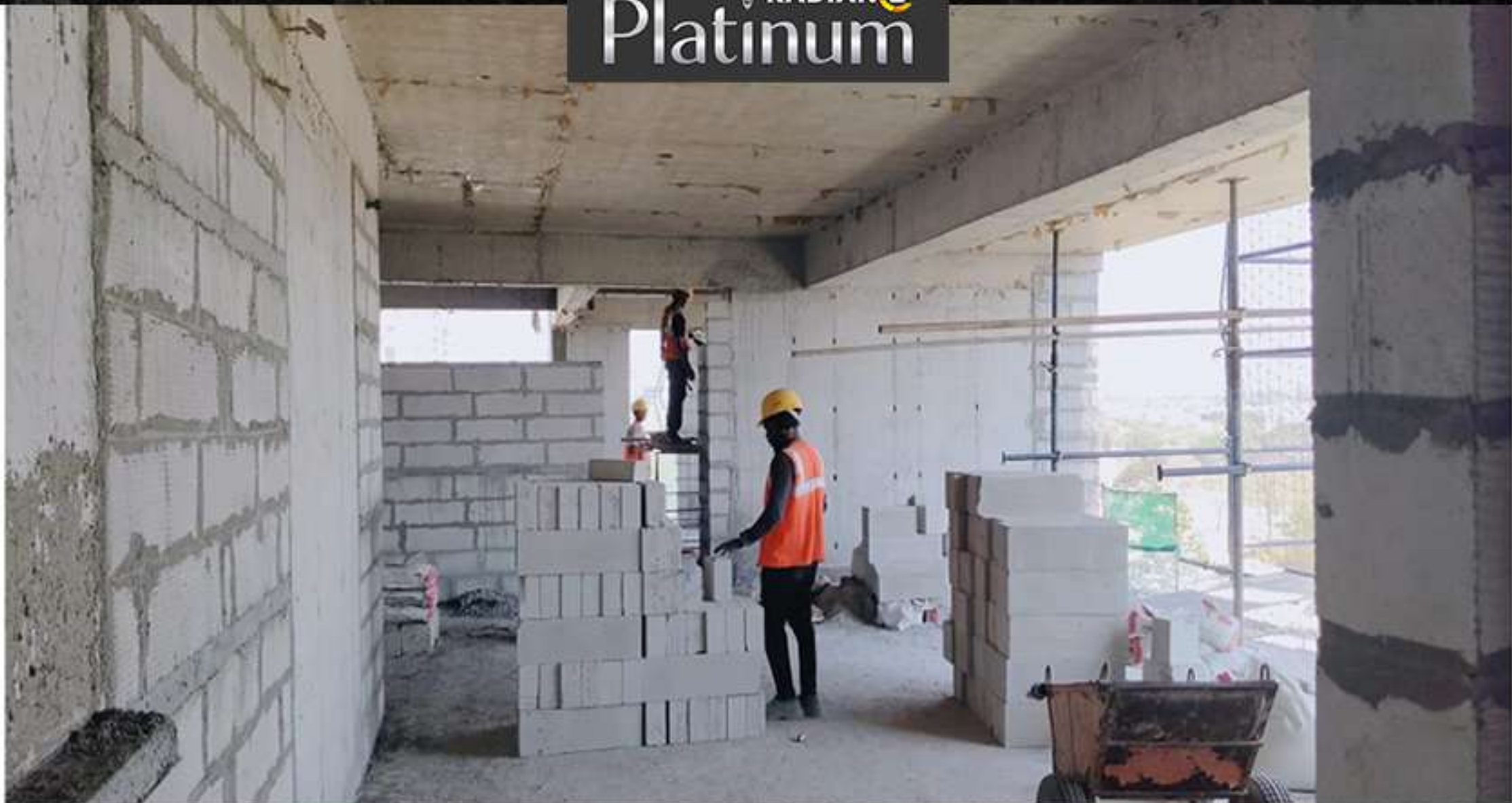
6th Floor Block Work