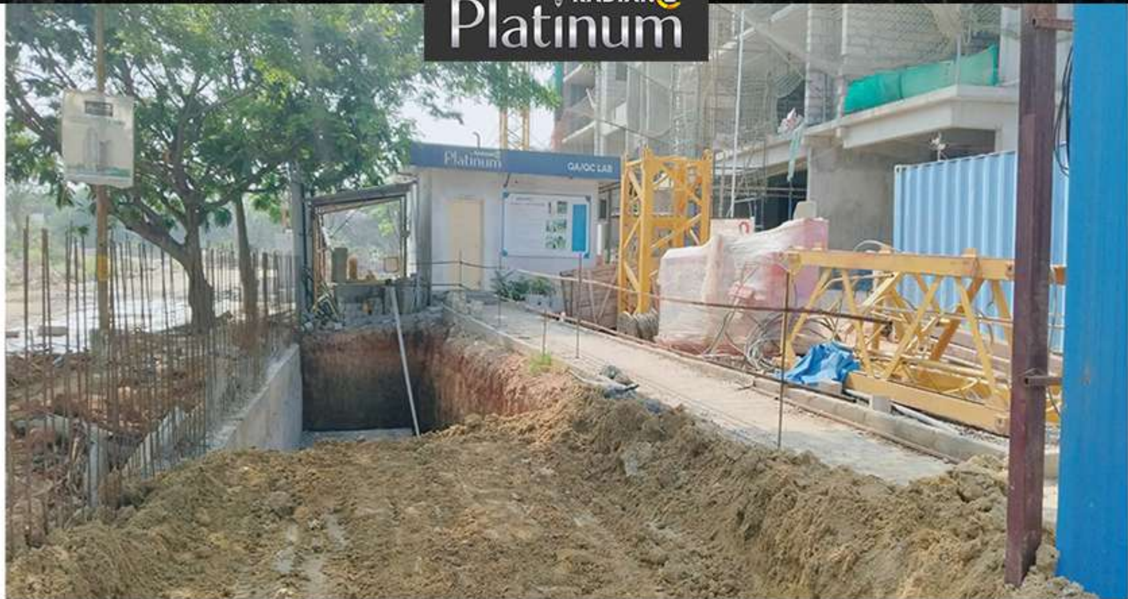
Compound Wall - North Side