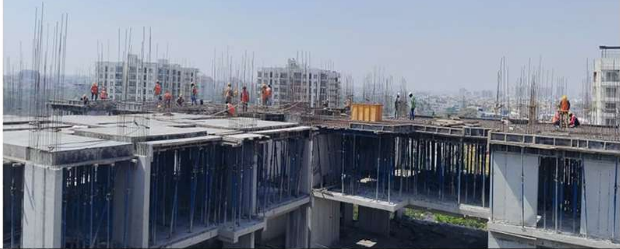
Block B - 9th Floor Roof Slab Reinforcement Work (B1003,b1004,B1005)