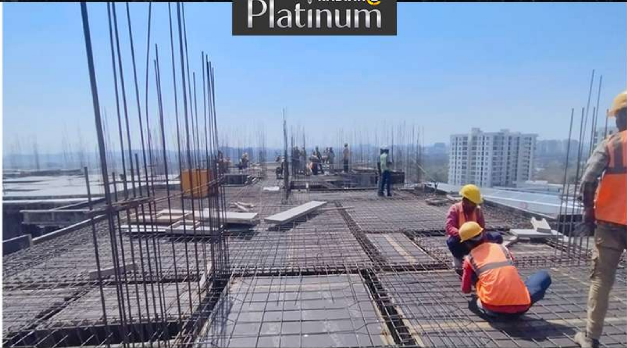
Block B - 9th Floor Roof Slab Reinforcement Work (B1003,b1004,B1005)