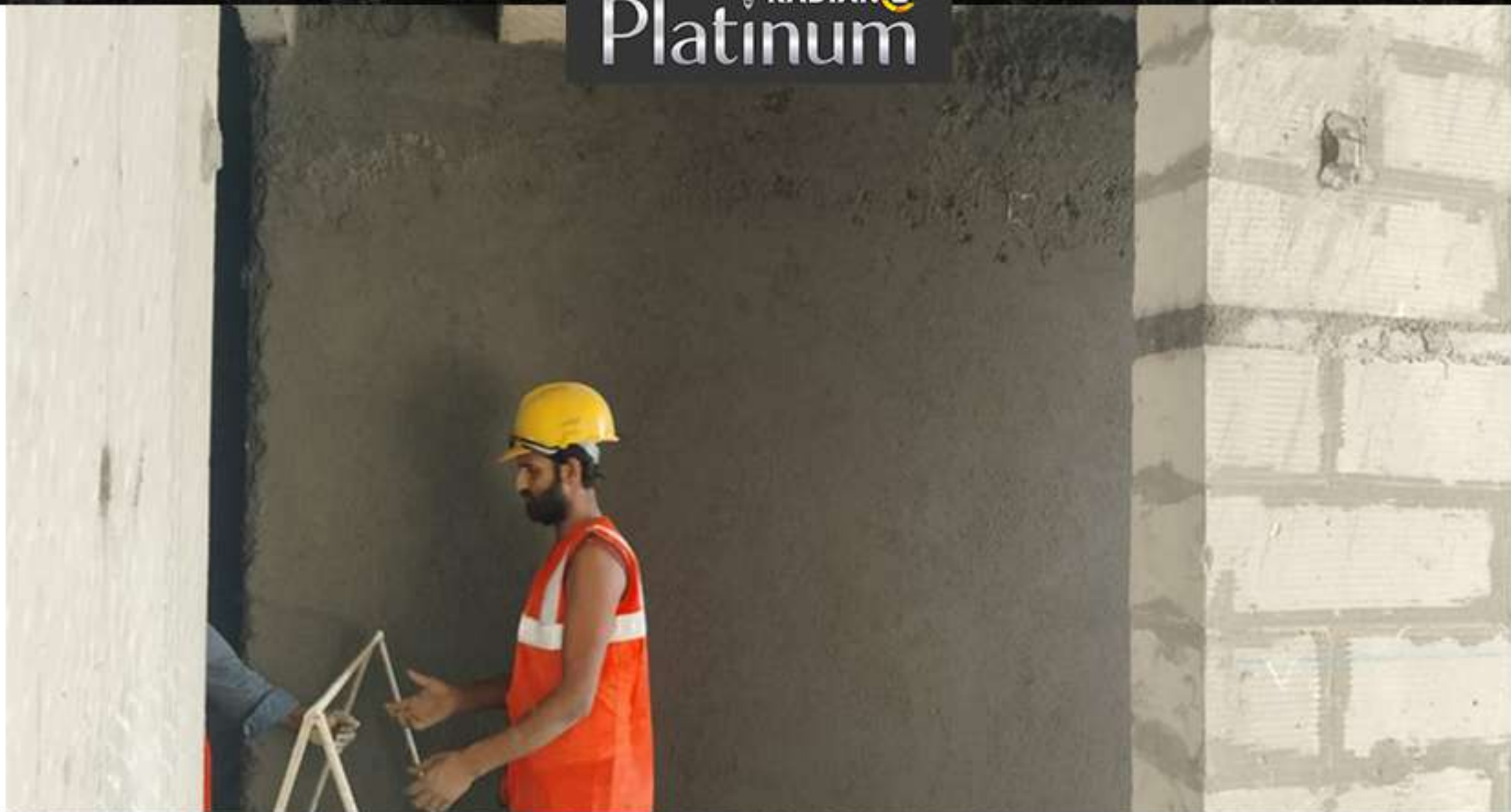
2nd Floor Internal Wall Plastering Work