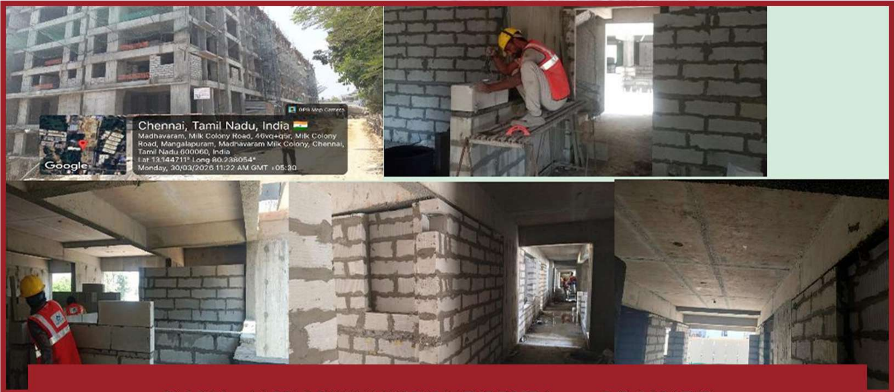
BLOCK A – AAC BLOCK WALL WORKS IN THE FIRST & second FLOOR LEVEL