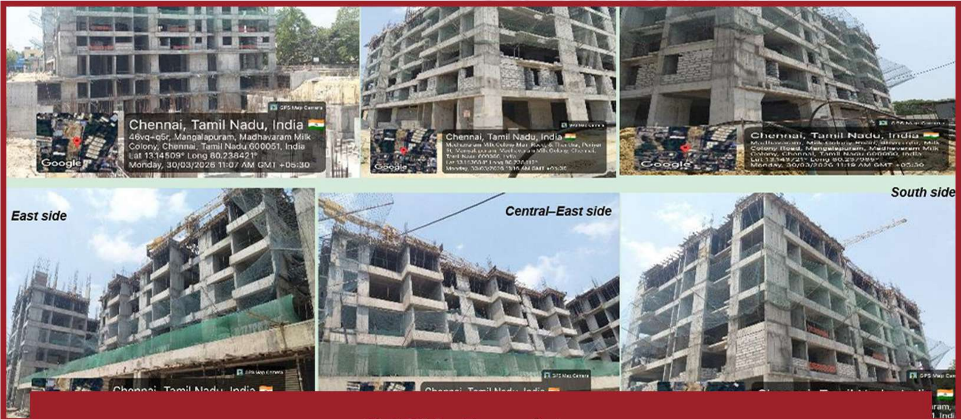
BLOCK A – External views