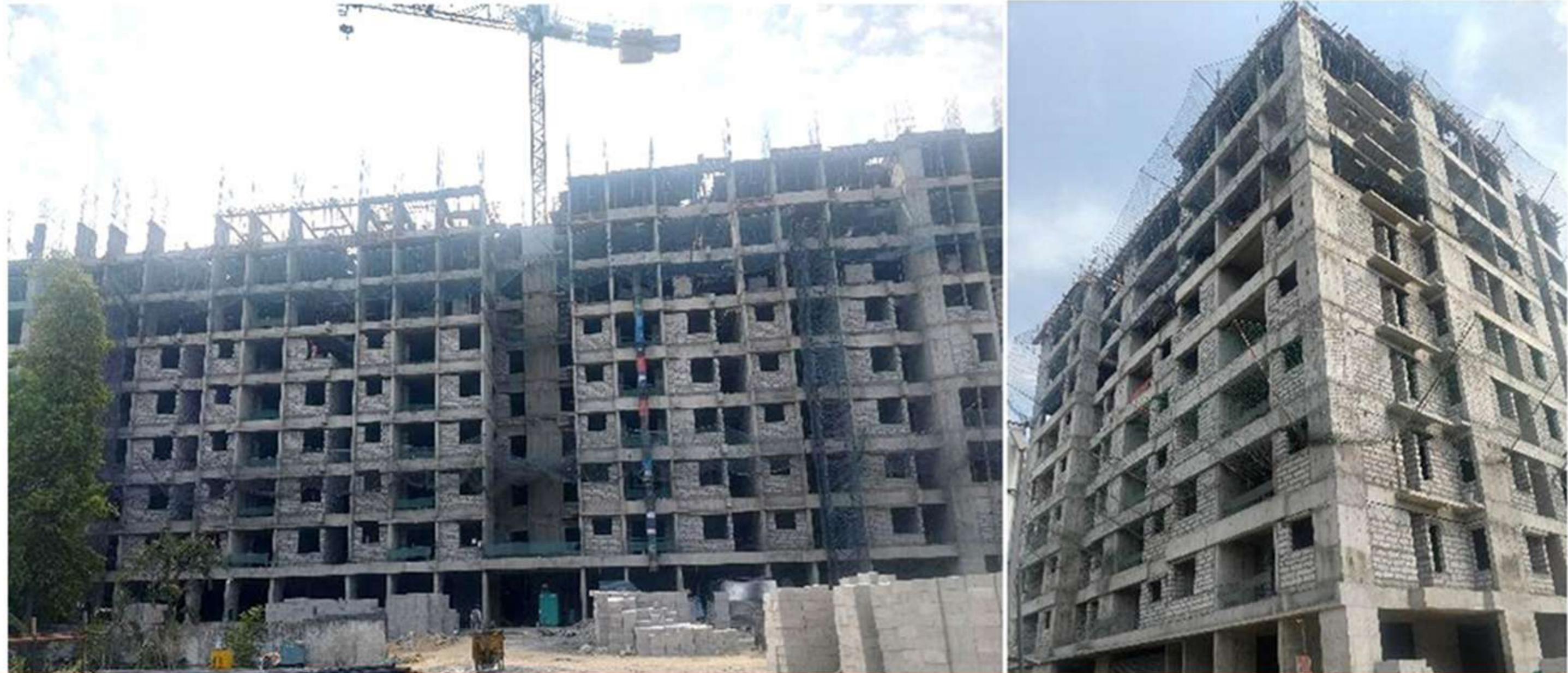
Block A – Elevation