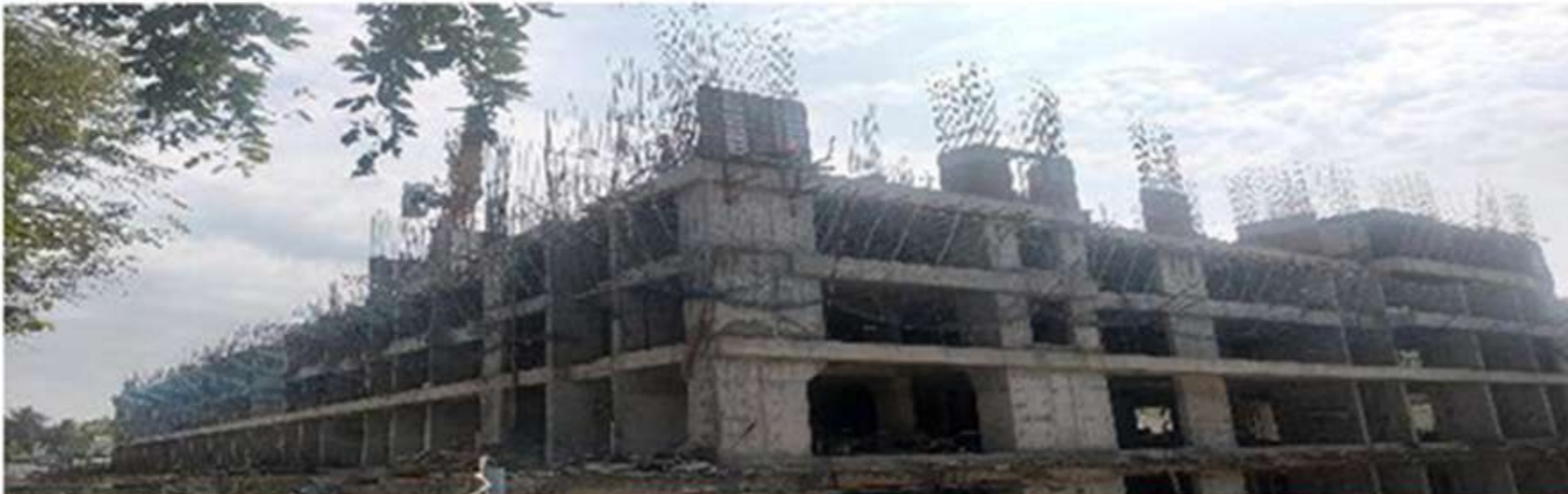
SOUTH WEST SIDE