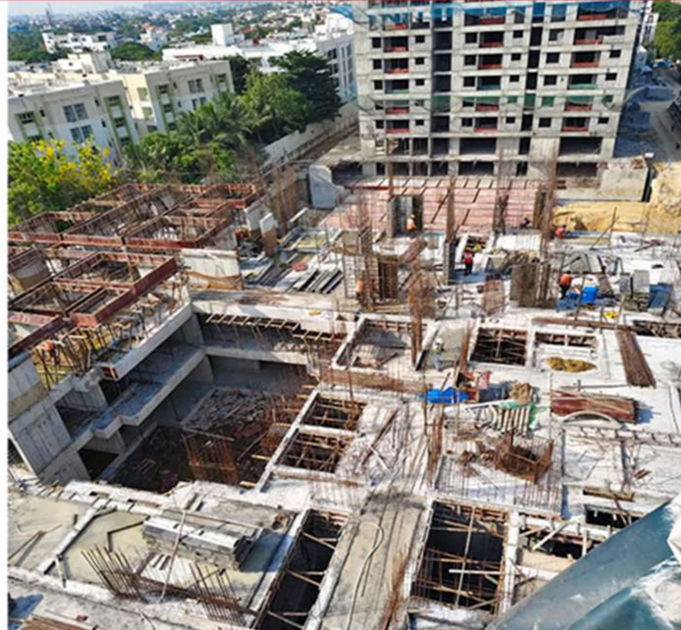
Block B, Club House & Block A