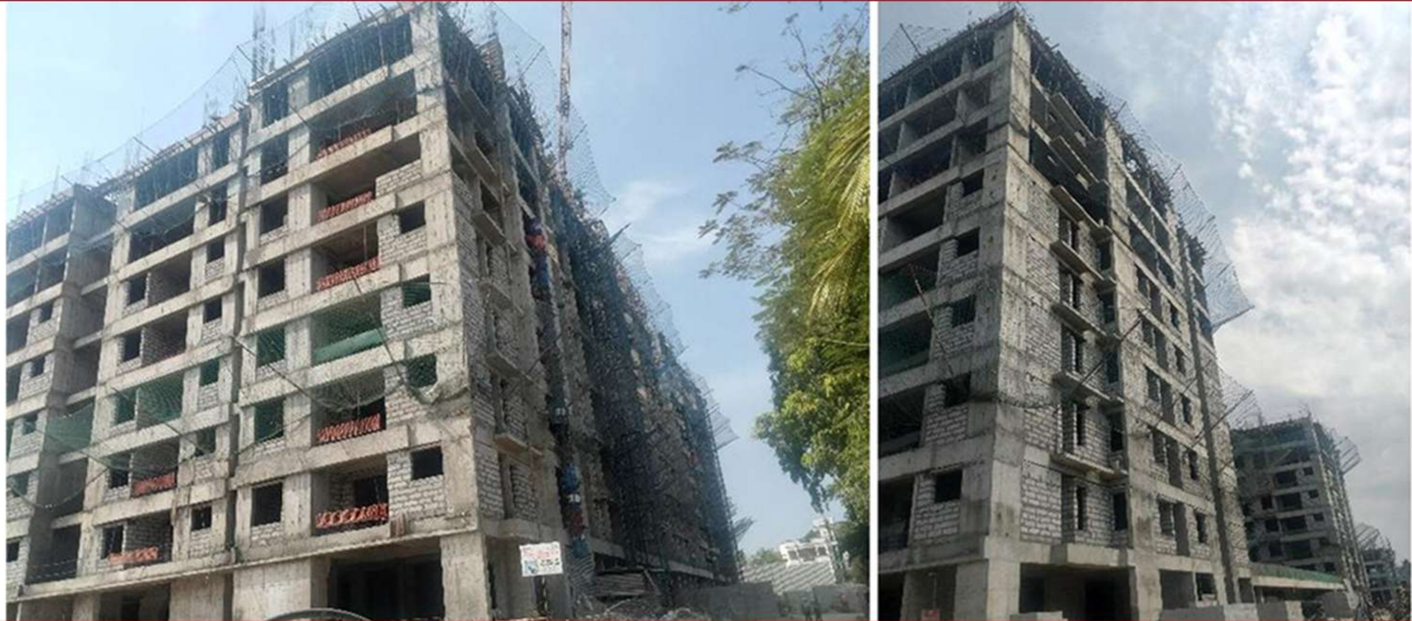
Block A – Elevation