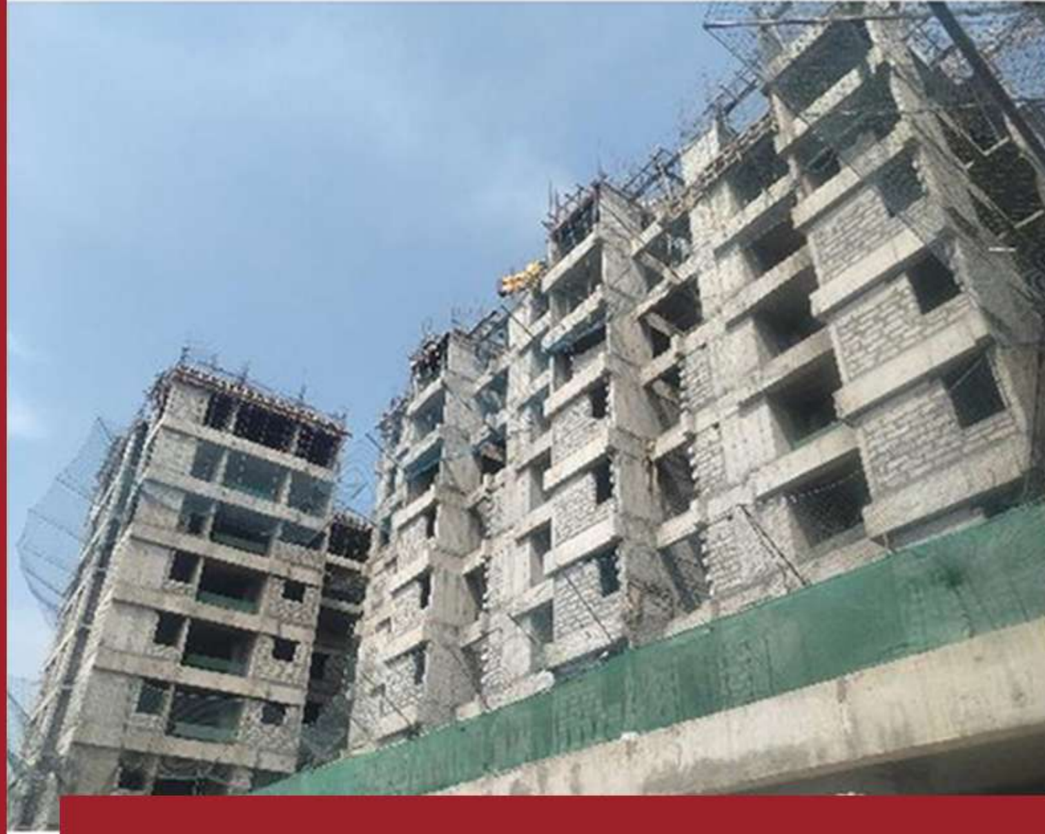
TOWARDS SOUTH -EAST SIDE