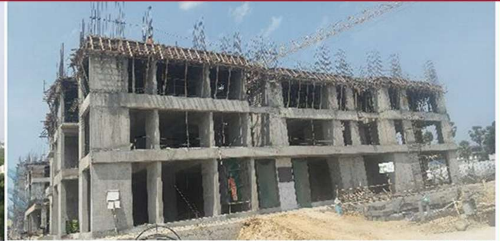
BLOCK - C