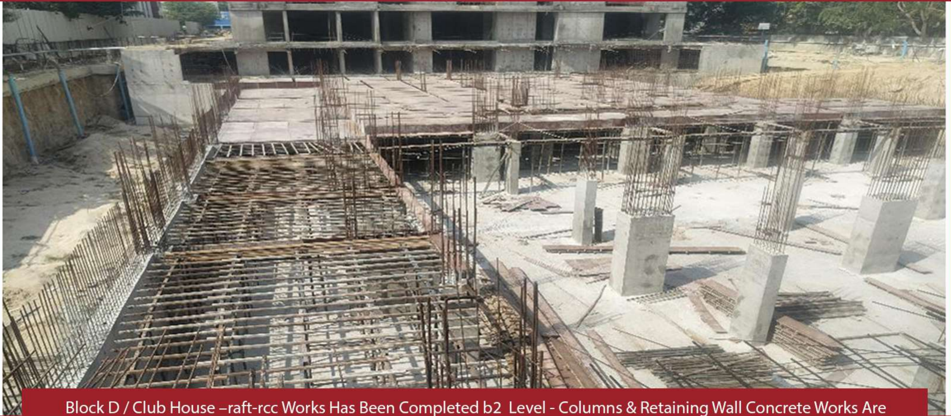
Block D / Club House –raft-rcc Works Has Been Completed b2 Level - Columns & Retaining Wall Concrete Works Are Completed. raft Above Soil Filling & Pcc Completed. B2 Roof Level Slab Shuttering Works In Progress