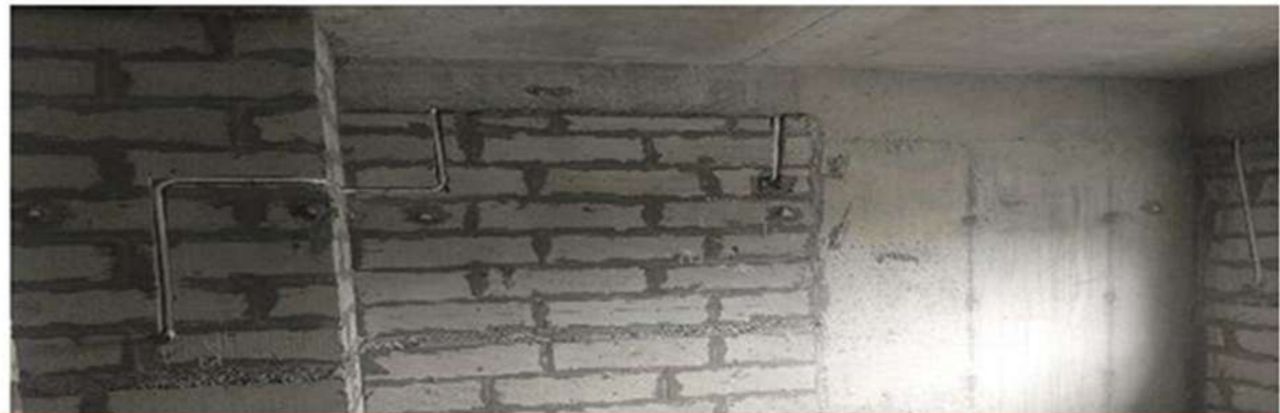
Block A – Aac Block Works ( 1- 6th Floor ) & Lintel Concrete Works lintel Concrete Works ( 1 St Floor ) Completed And Electrical Wall Chasing & Conduit Instalation Wip