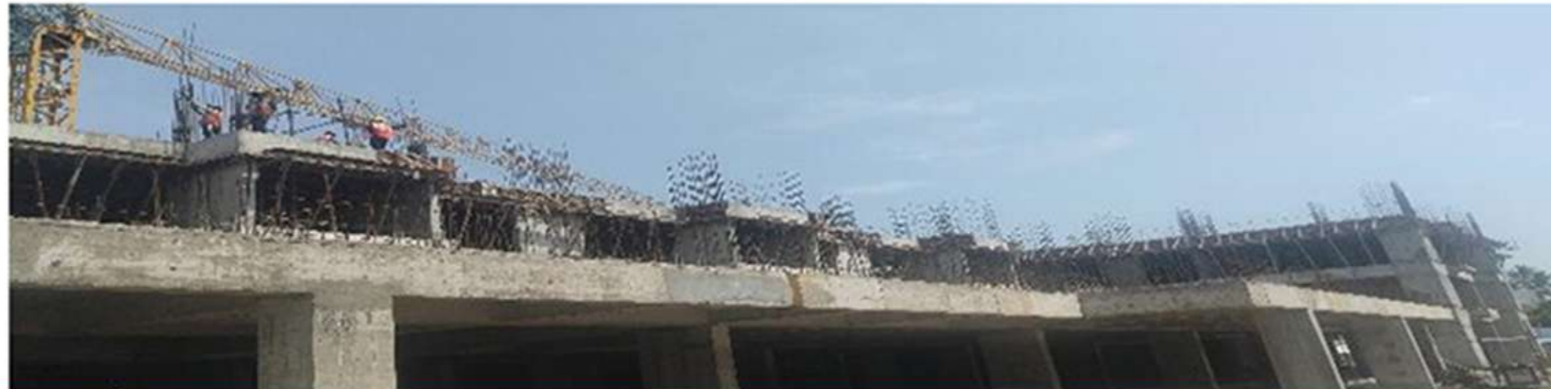
NORTH EAST SIDE