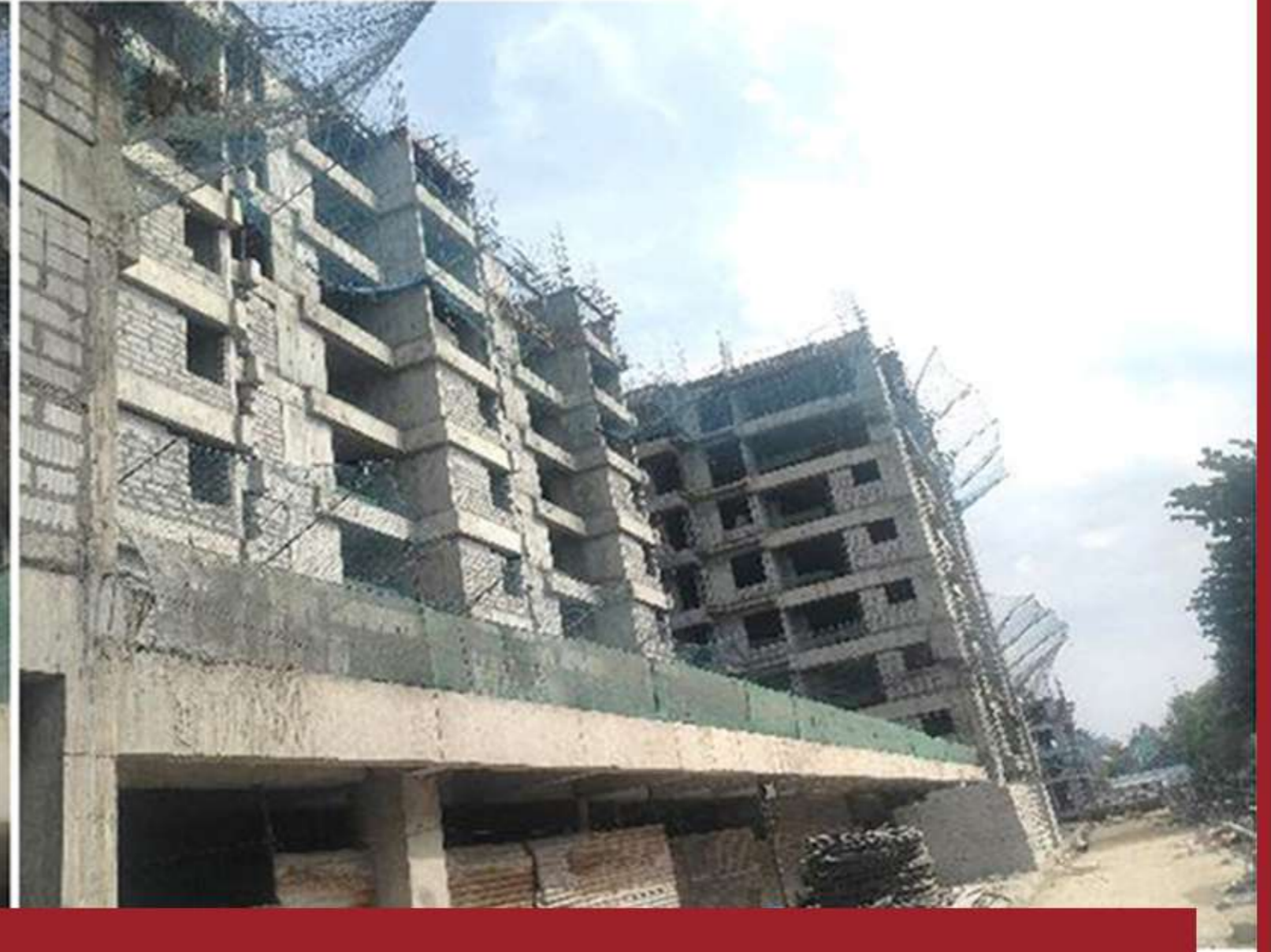
Block A – Elevation