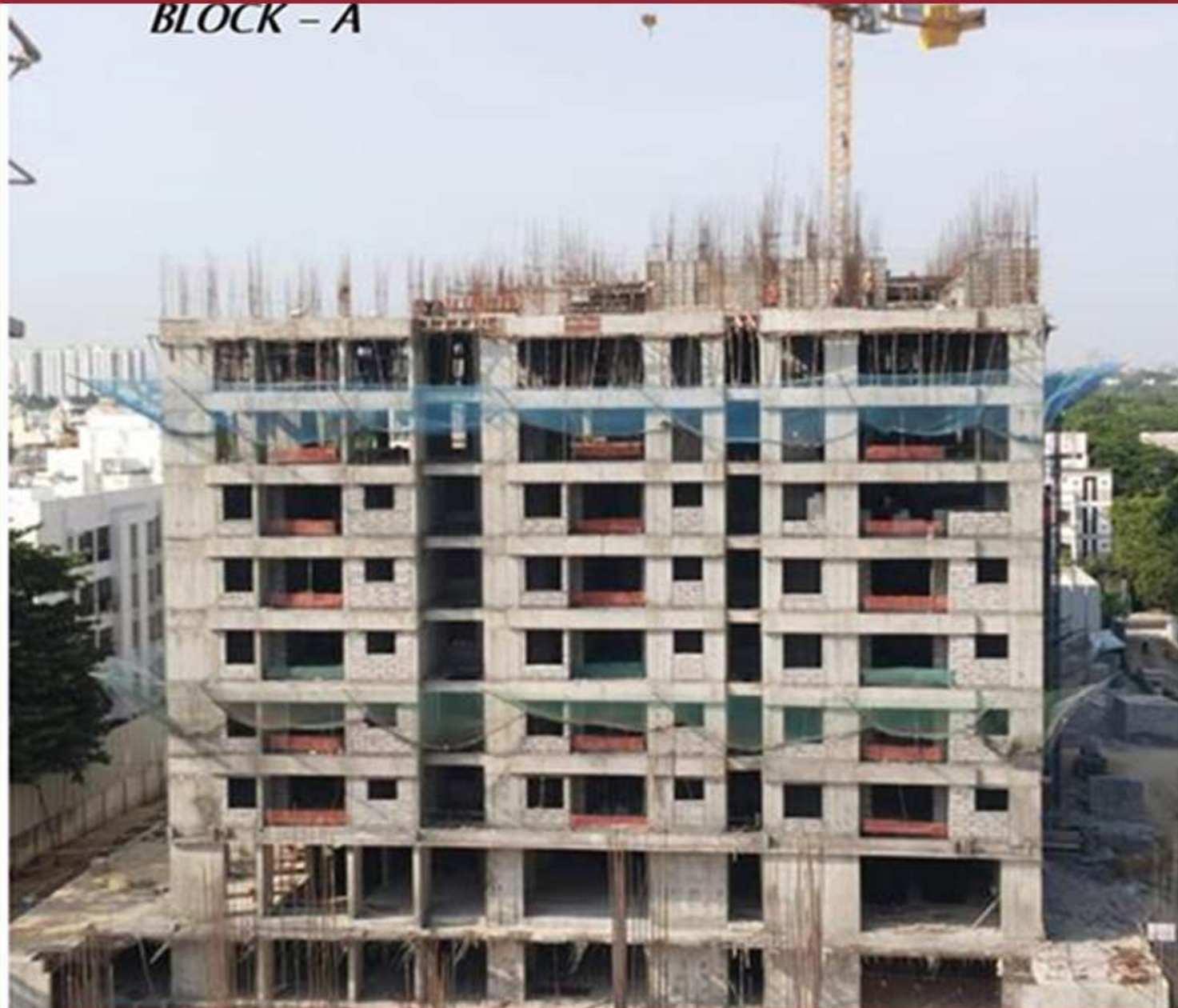
BLOCK - A