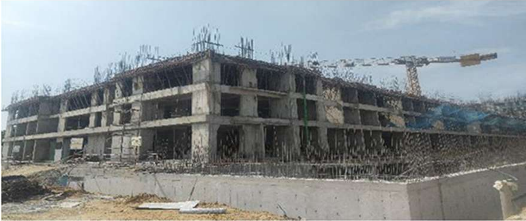
NORTH WEST SIDE