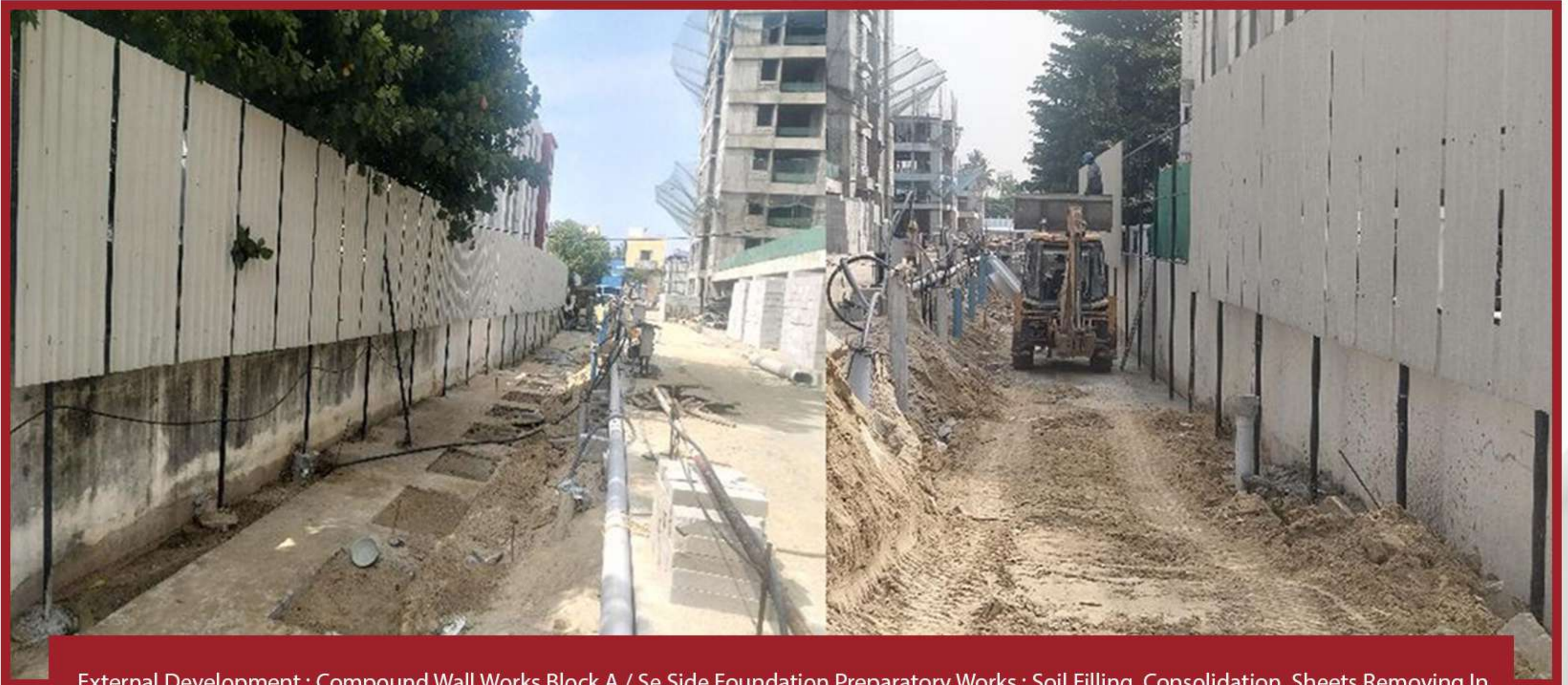
External Development : Compound Wall Works Block A / Se Side Foundation Preparatory Works : Soil Filling, Consolidation, Sheets Removing In Progress And Pcc Completed