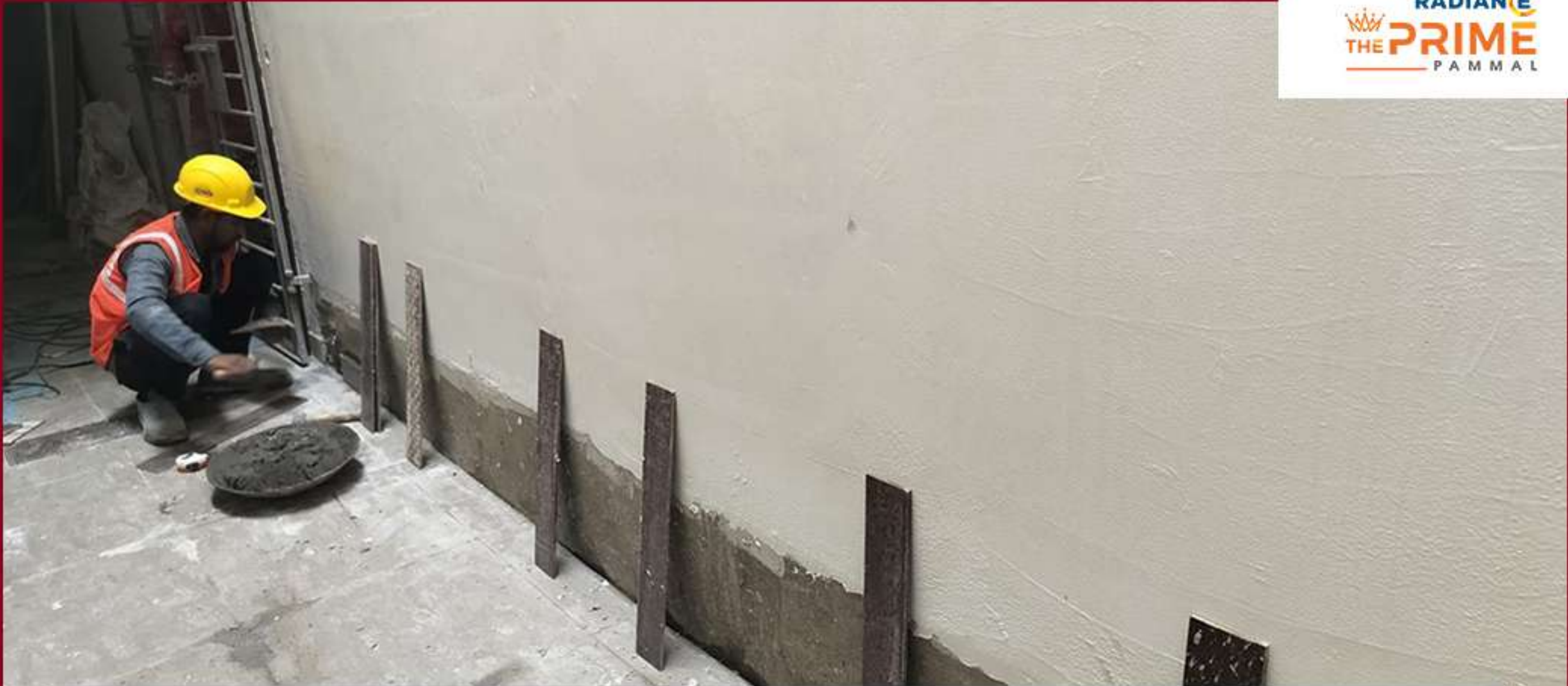
Block 1 –Cluster C Corridor Skirting Tile Laying Work In Progress