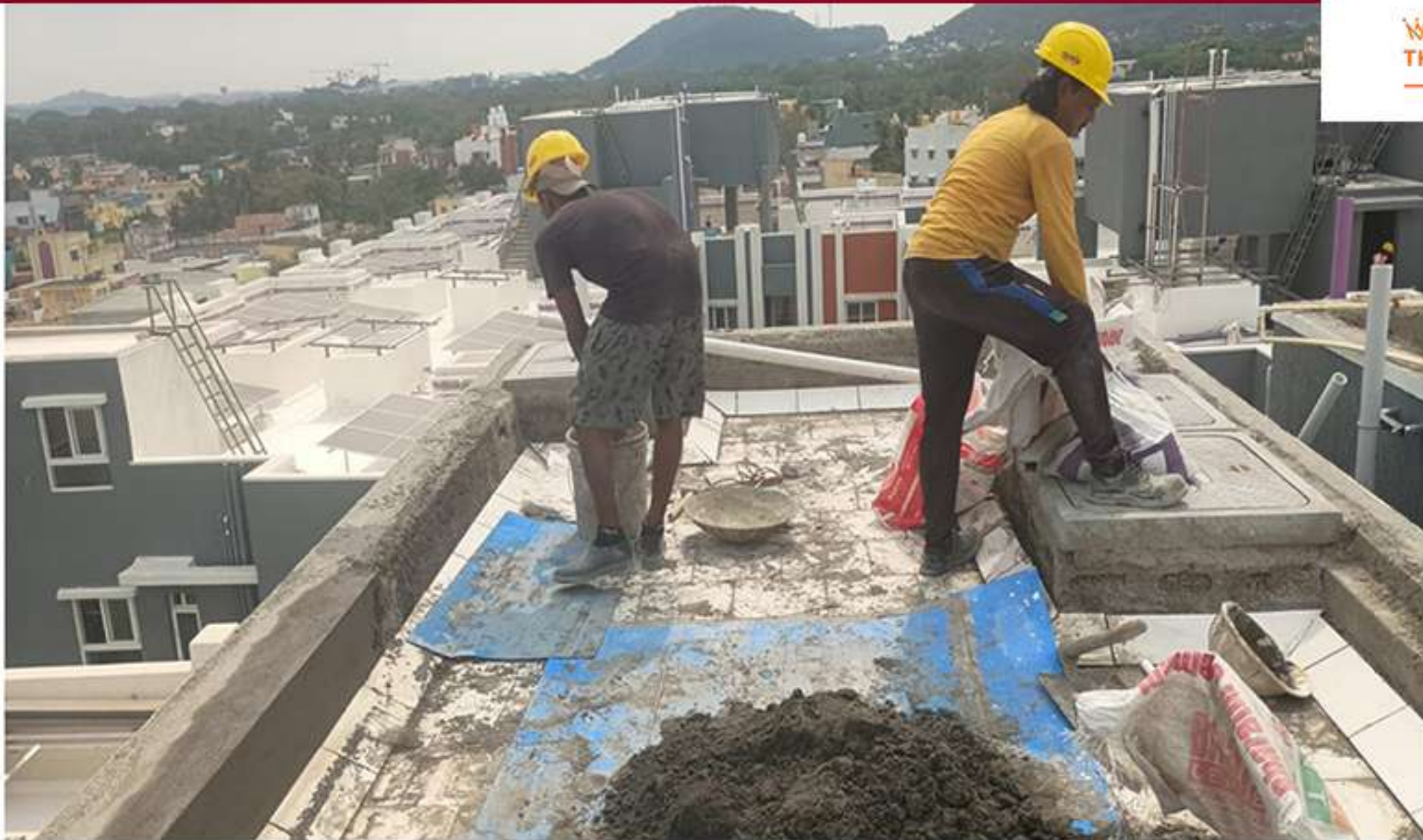
Cluster E OHT Skirting Above Plastering Work in Progress