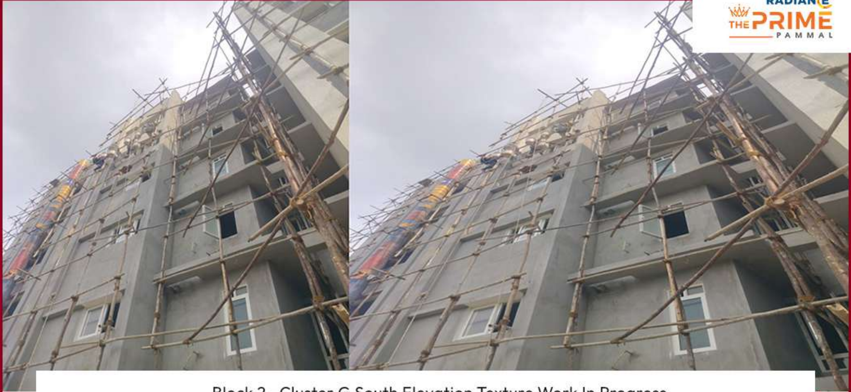
Block 2 -Cluster G South Elevation Texture Work In Progress