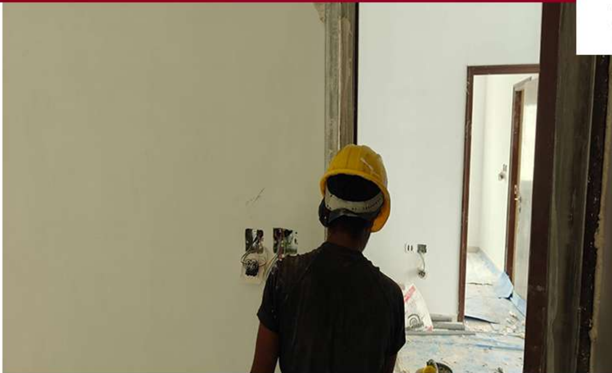
Block 1 -Cluster B Jams Correction Work in Progress