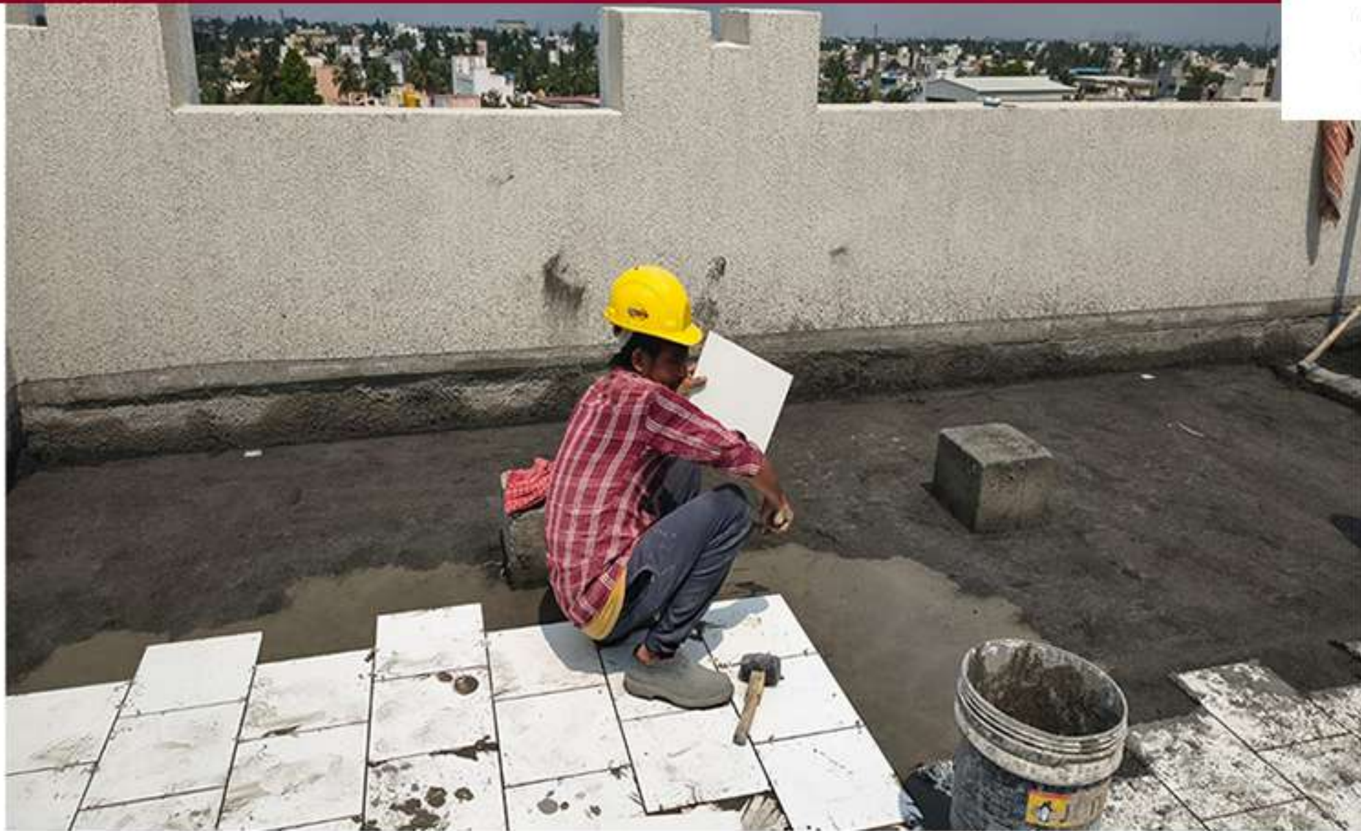
Block 1 –Cluster B Terrace Tile Laying Work in Progress