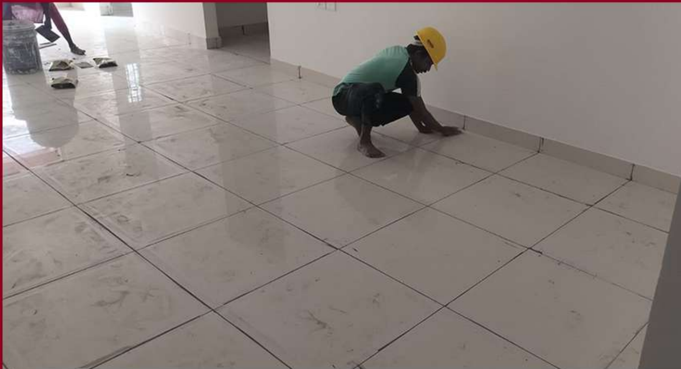
Block 1 –Cluster D Grouting Work In Progress