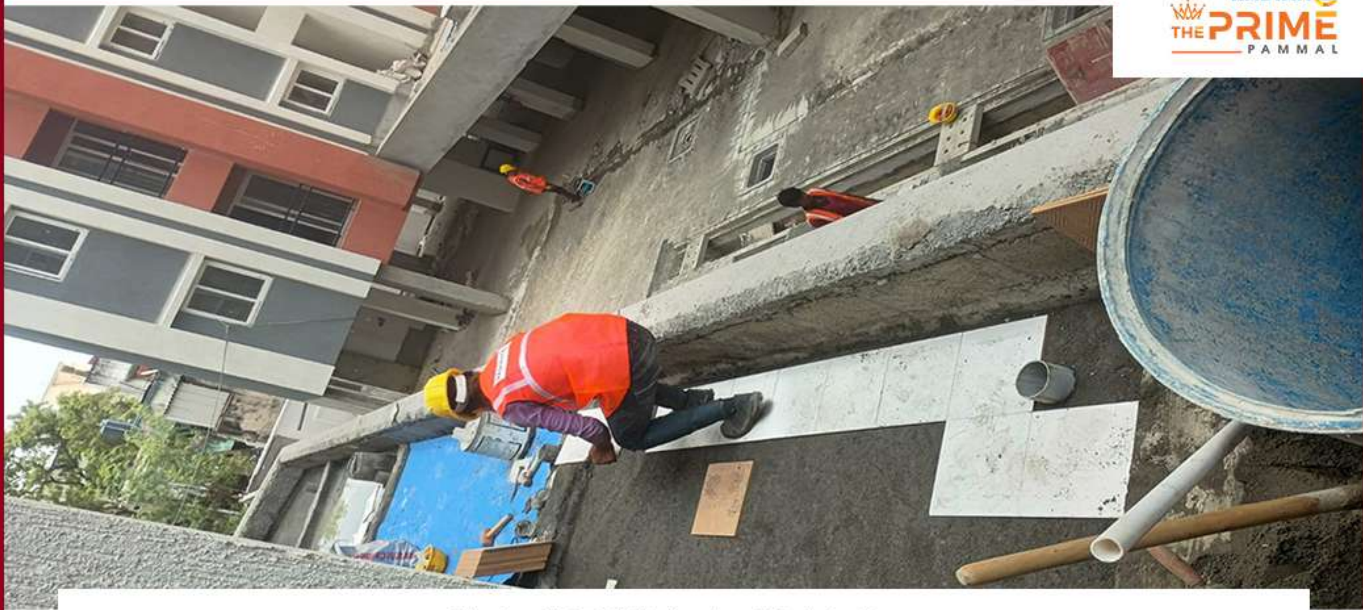
Cluster E OTS Tile Laying Work in Progress