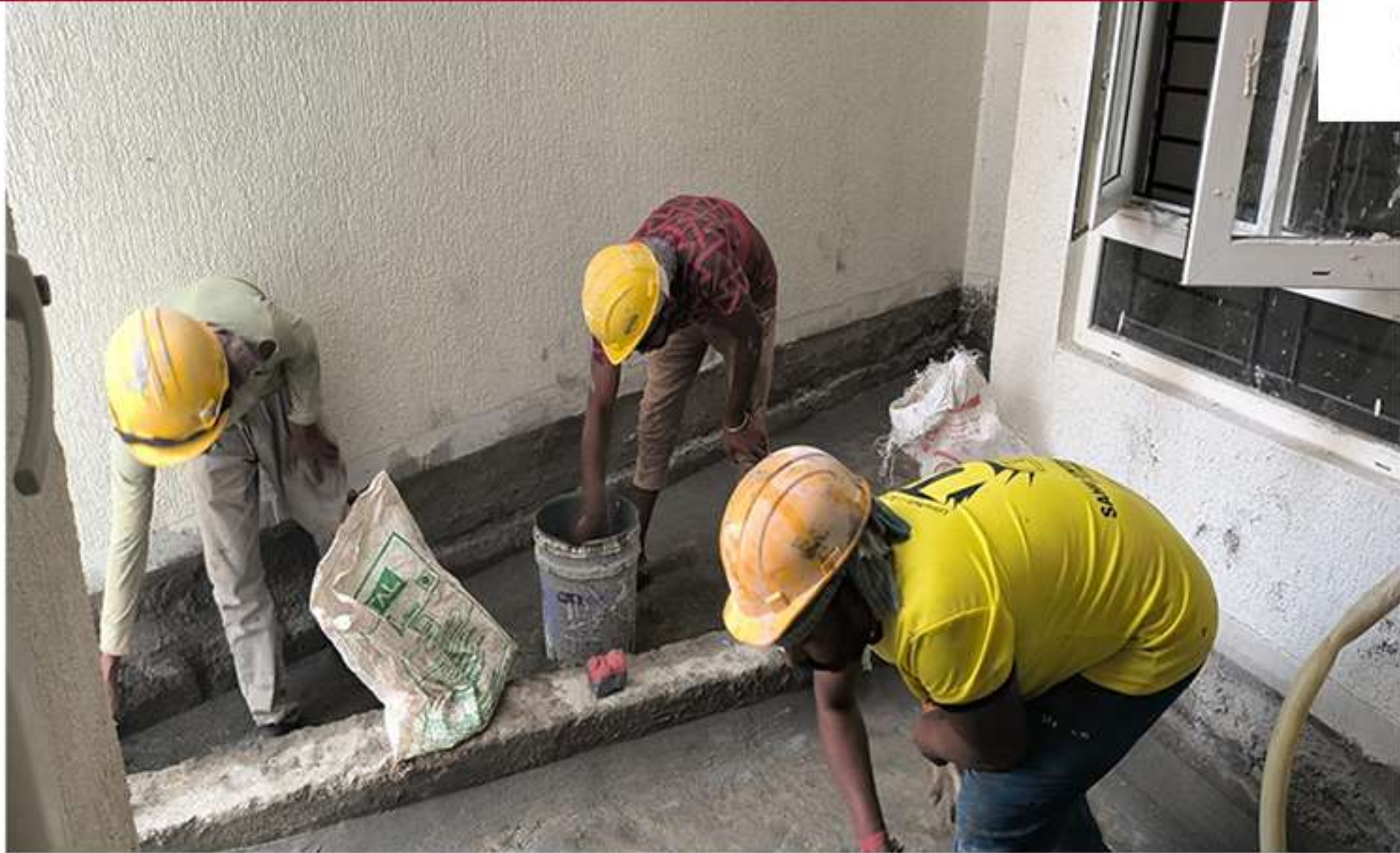
Block 1 -Cluster B OTS Waterproofing Work in Progress