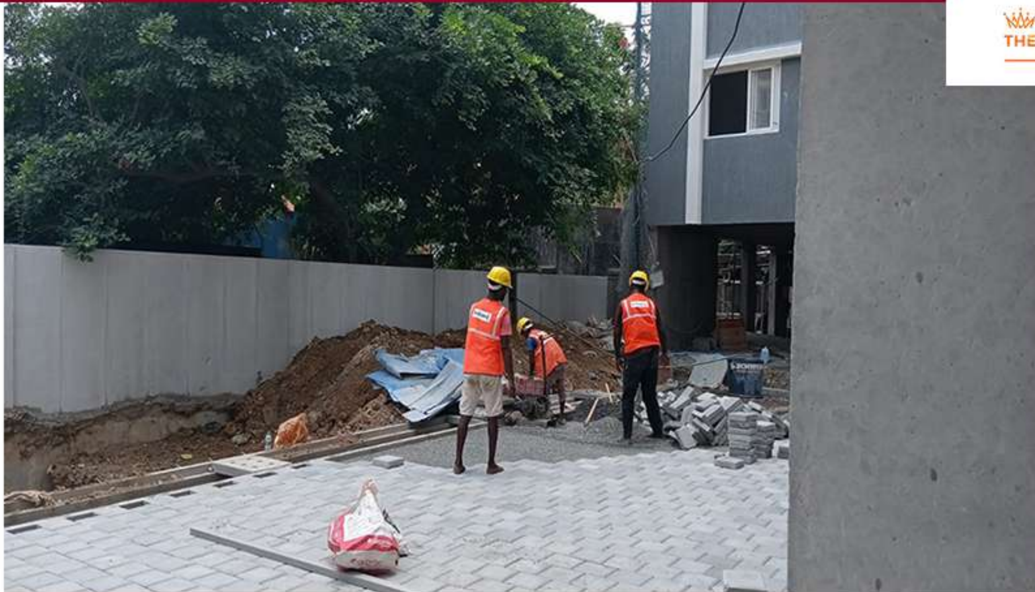
External Driveway Paver Block Fixing Work In Progress