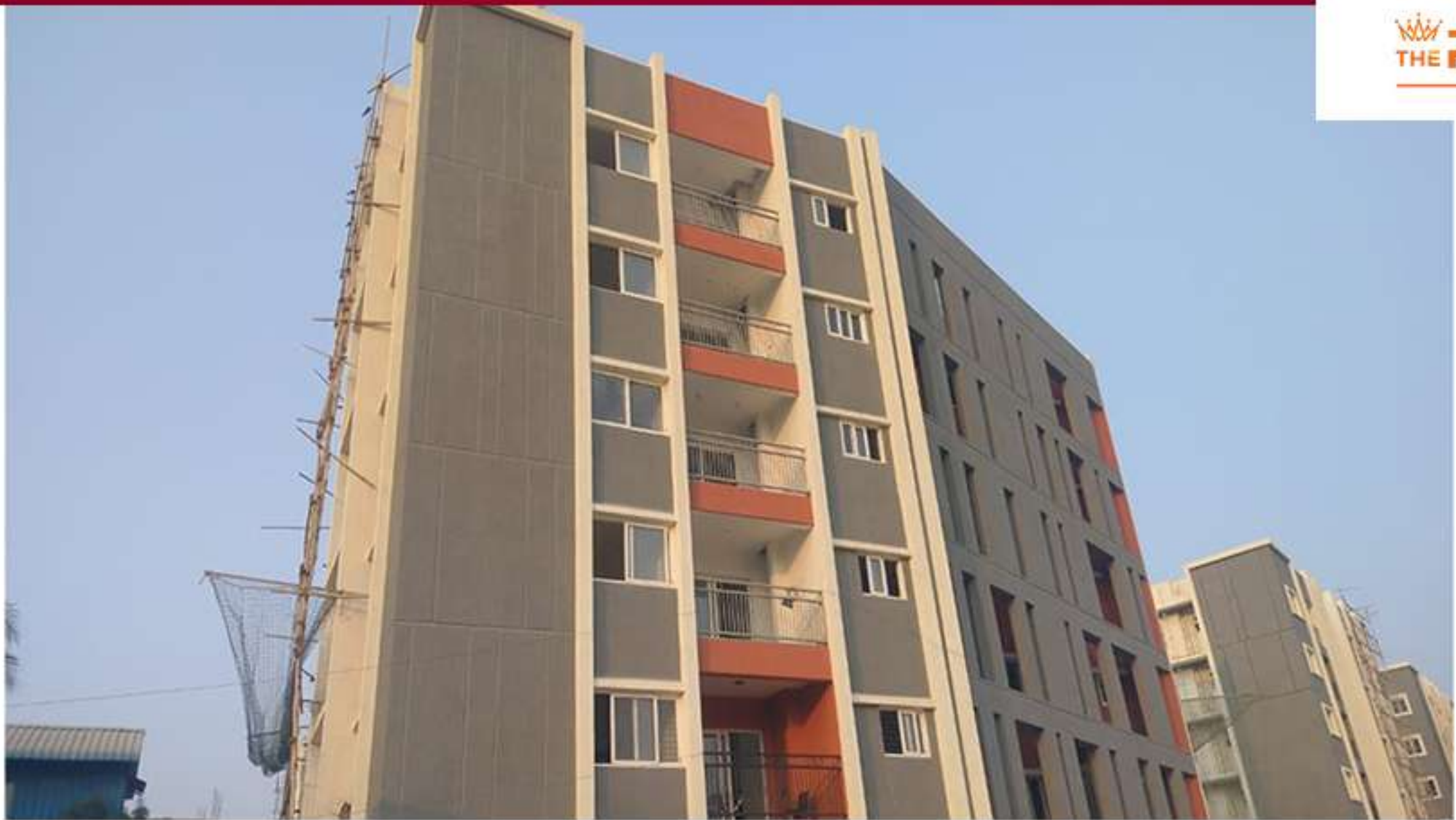
Elevation Block A