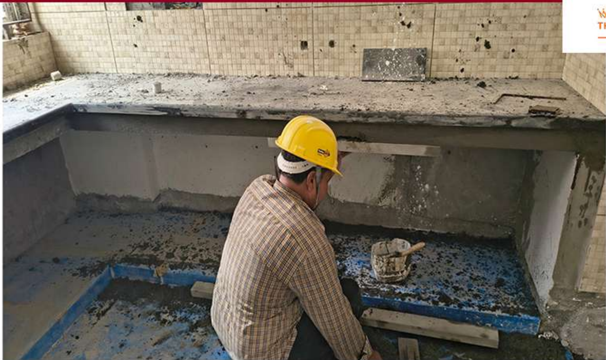
Block 1 –Cluster A Kitchen Counter Plastering Work in Progress