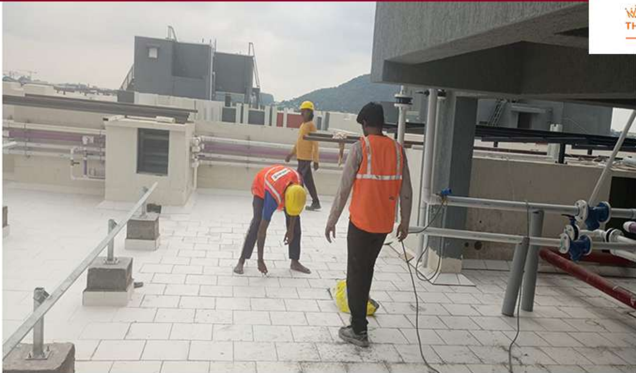
Cluster E Terrace Tile Grouting Work in Progress