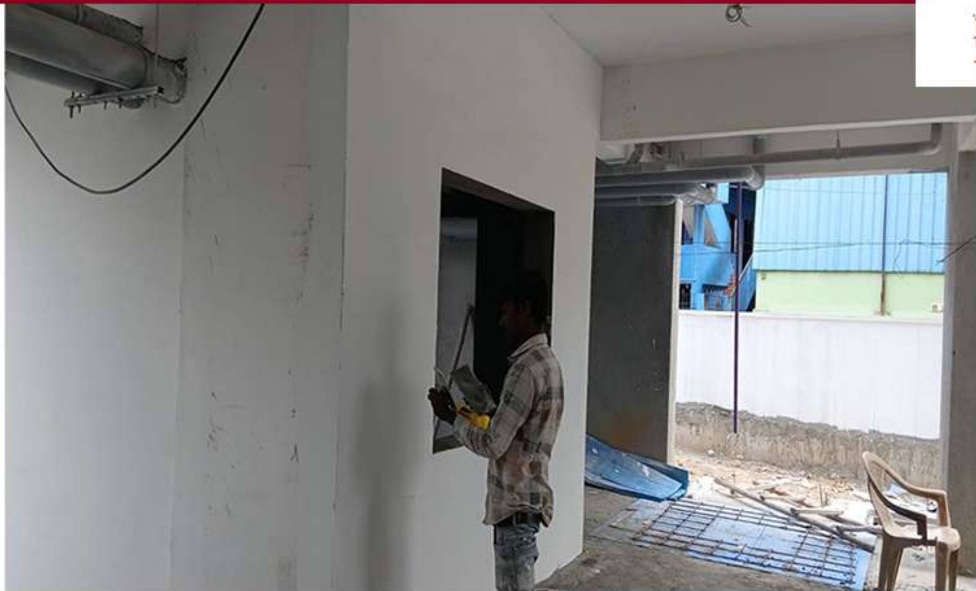
Block J Stilt Floor Putty Work in Progress