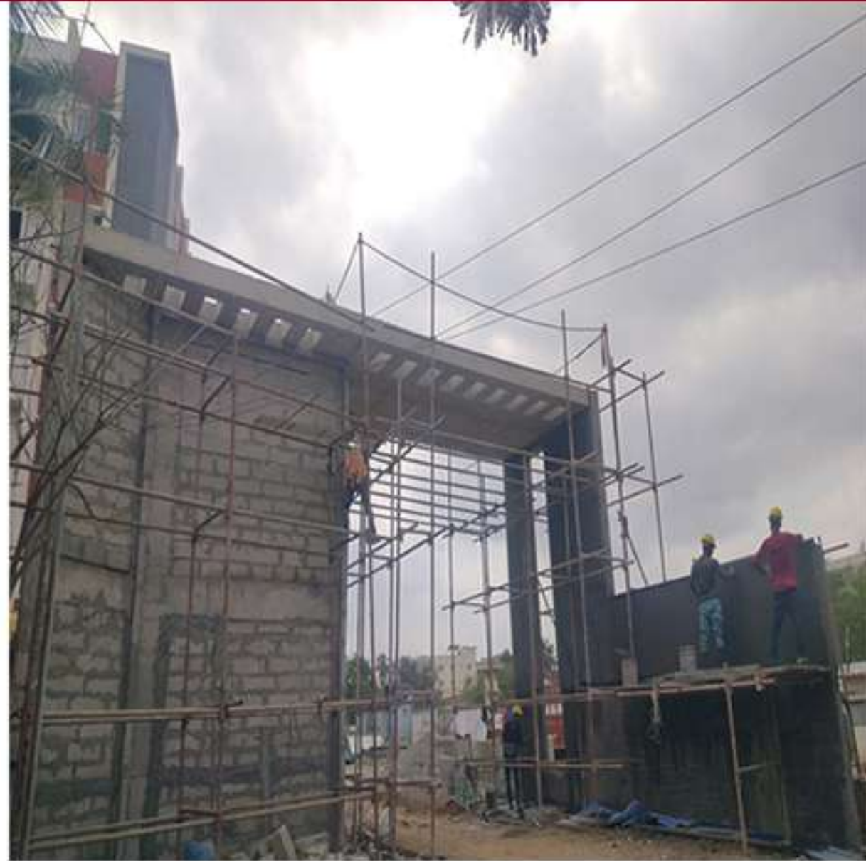
Entry Portal Block Work & Plastering Work In Progress