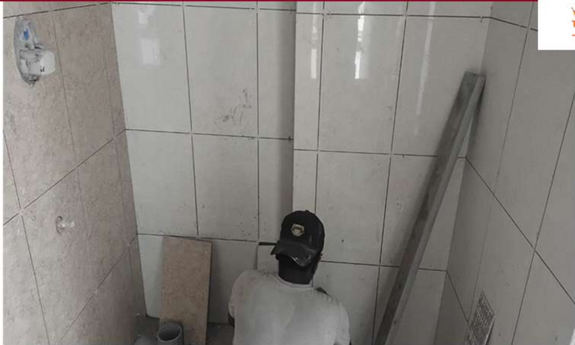
Block 2 -Cluster G Tiles Laying Work In Progress