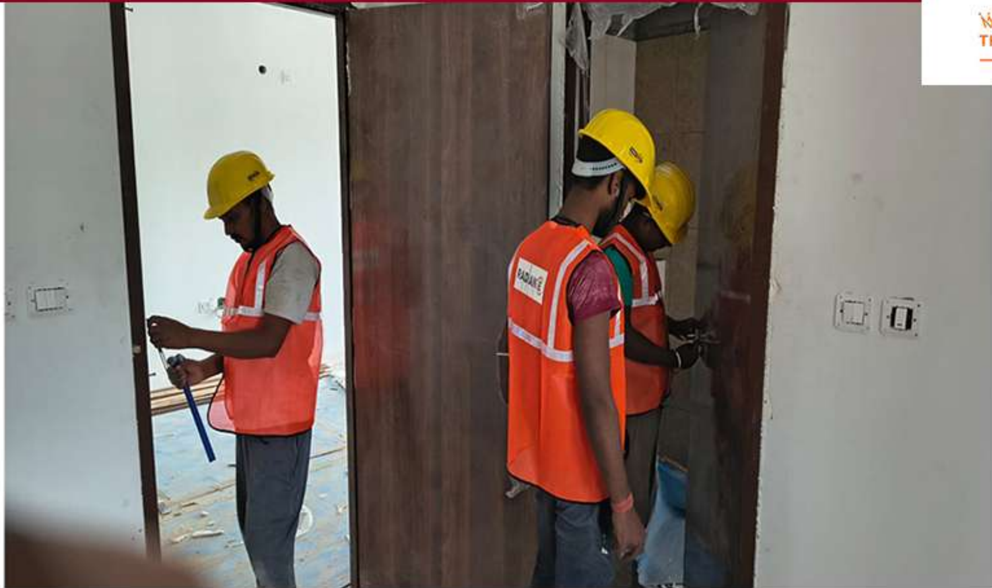
Block 1 –Cluster A Door Fixing Work in Progress