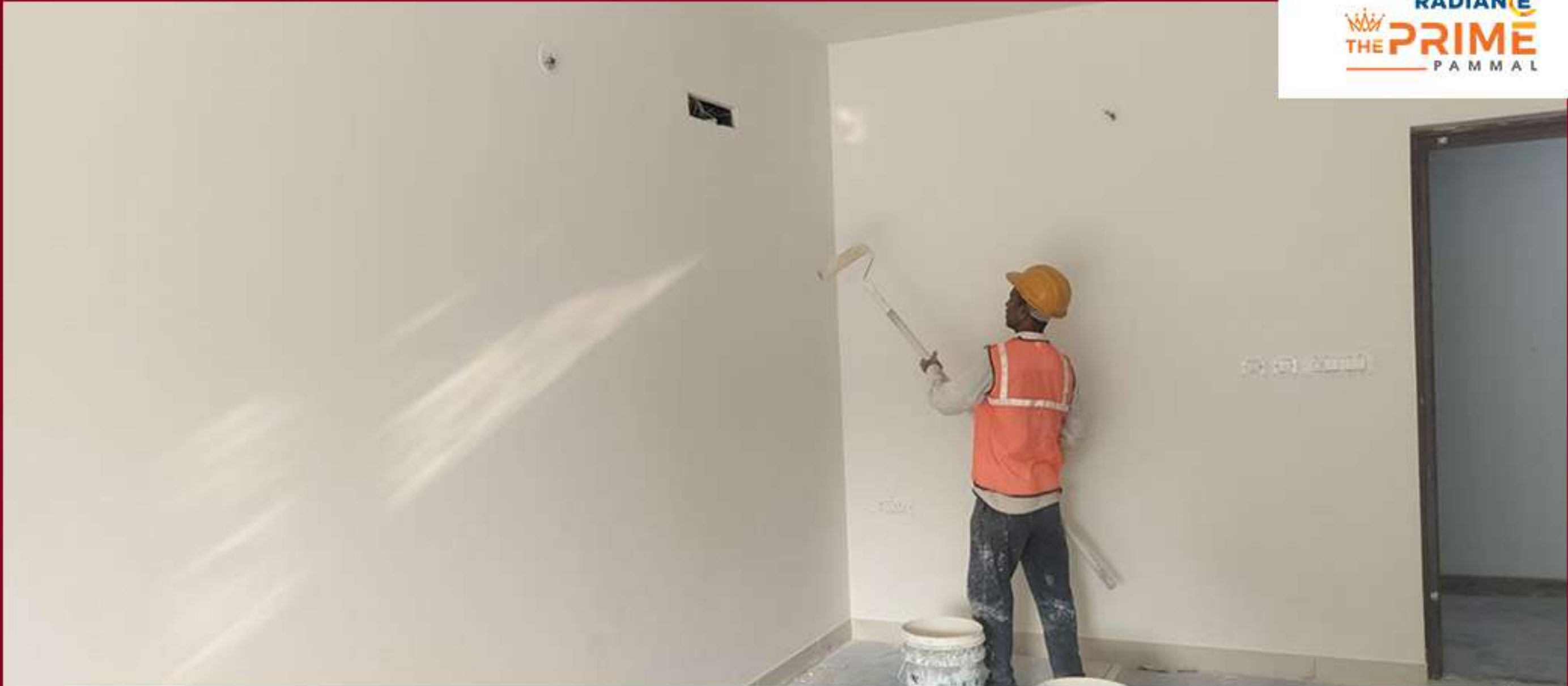
Block 1 -Cluster C 1st Coat Painting Work In Progress