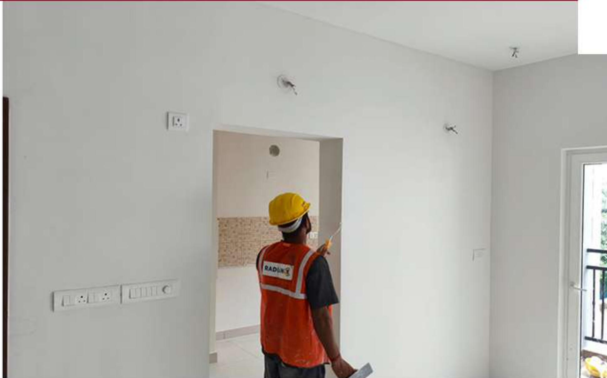
Block H 1st Coat Painting Work in Progress