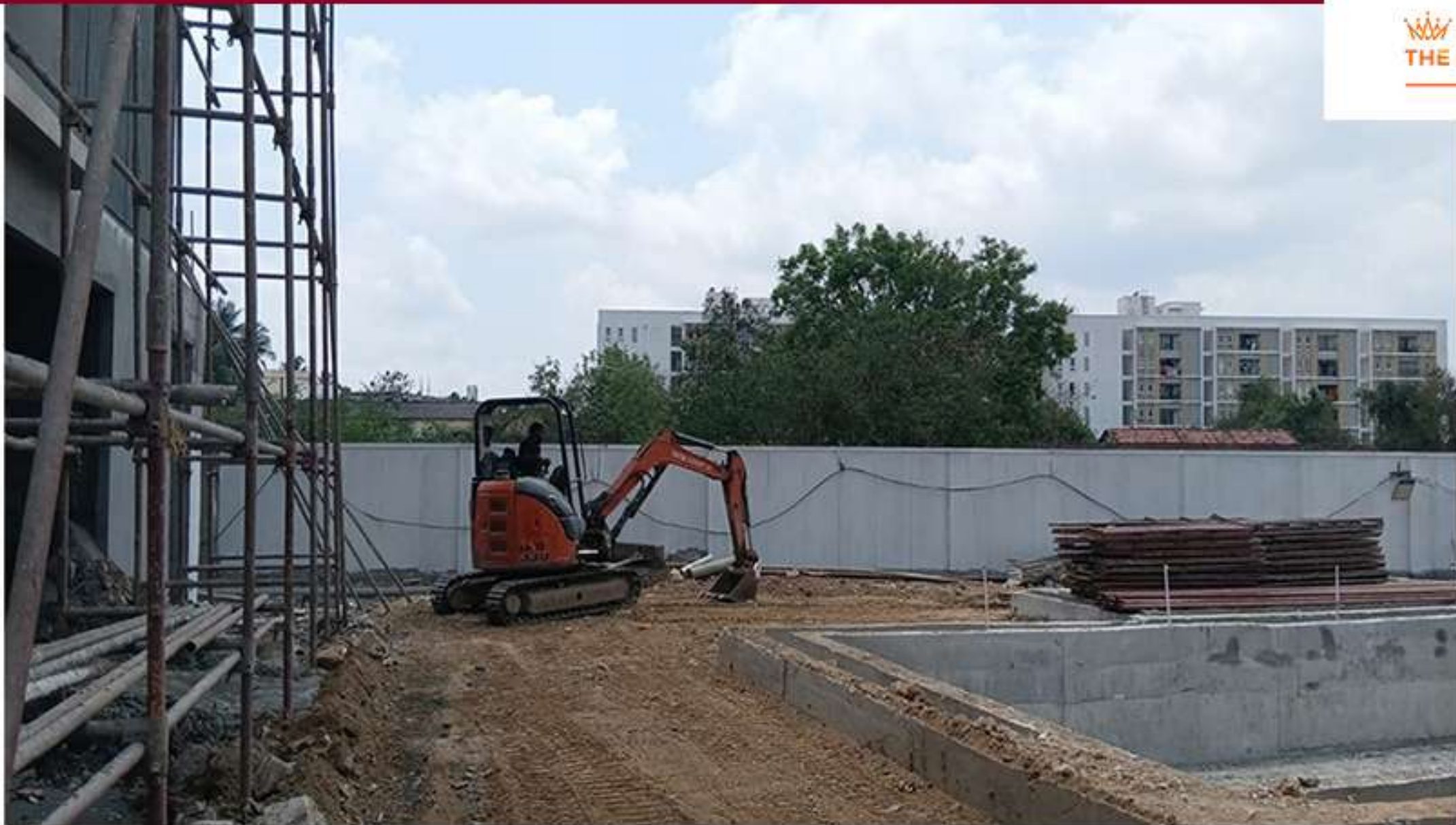
Swimming pool Deck Area Soil Leveling Work In Progress