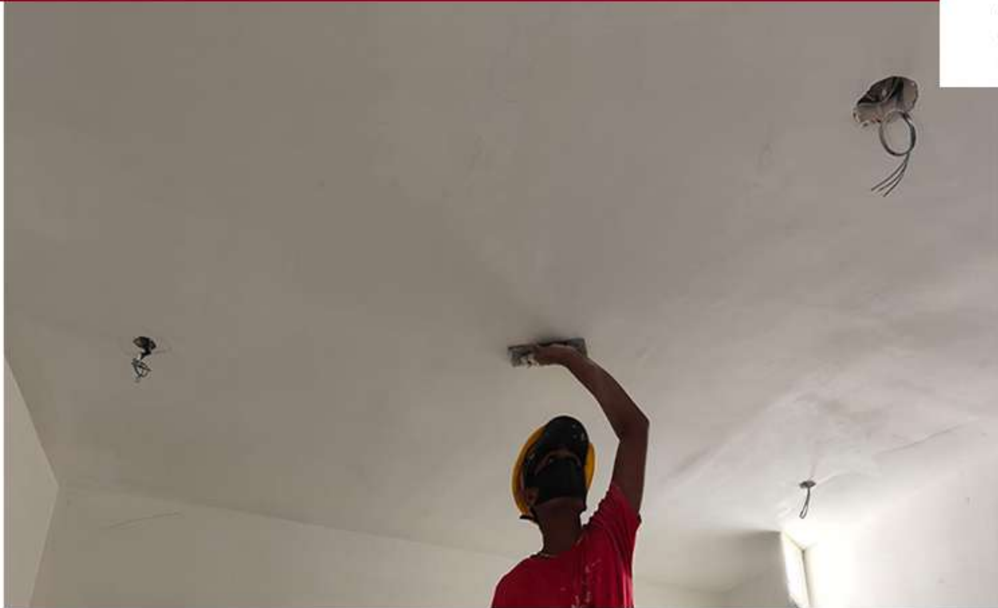
Block 1 -Cluster B Painting Preparation Work in Progress