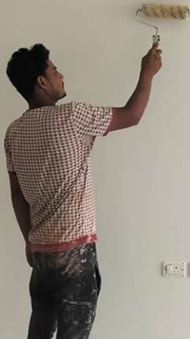
Block 1 -Cluster D 1st Coat Painting Work In Progress