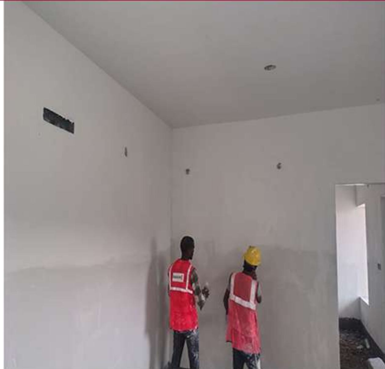
Block 2 -Cluster G Putty Work In Progress