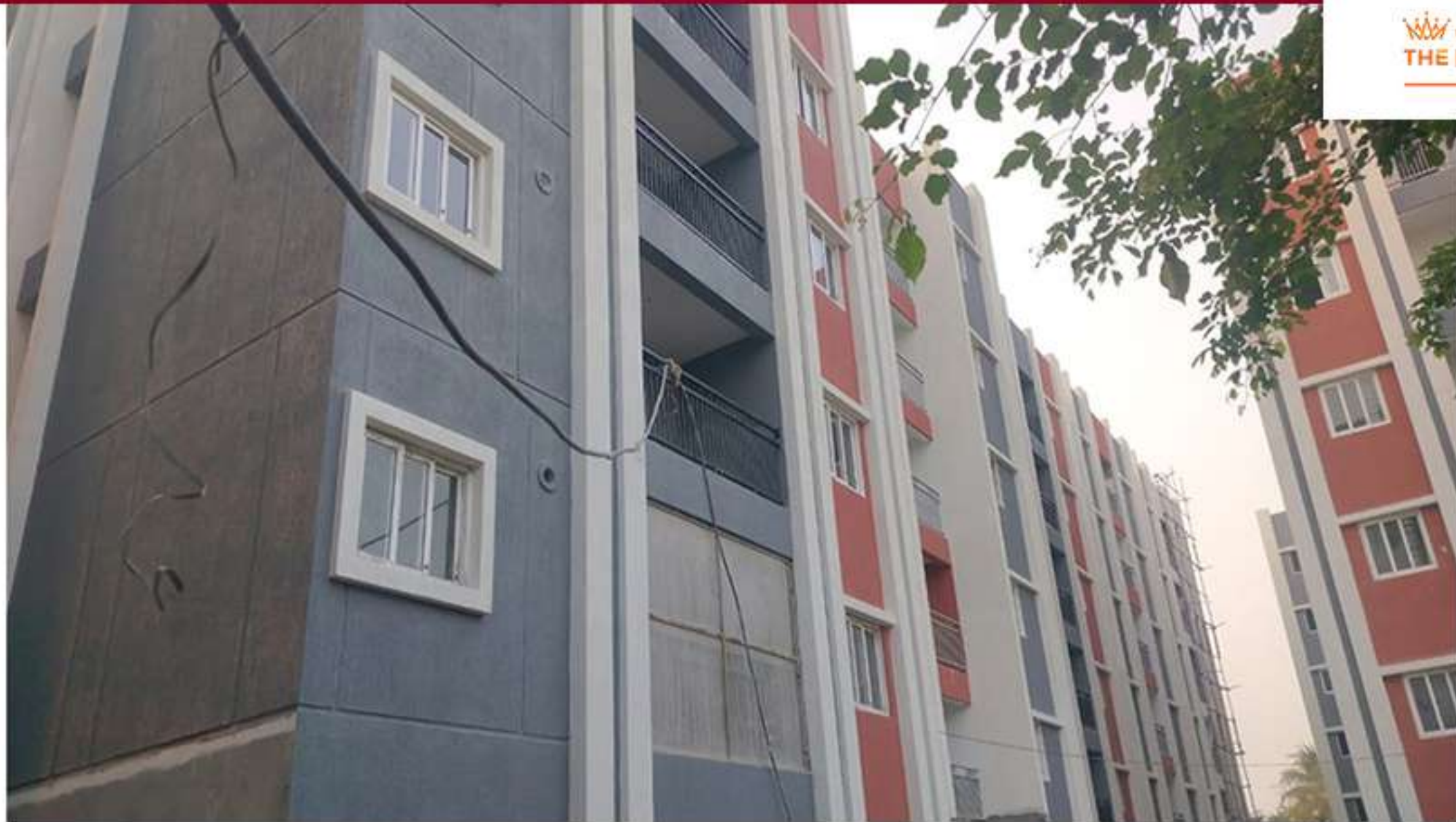
Elevation Block 1 E & F