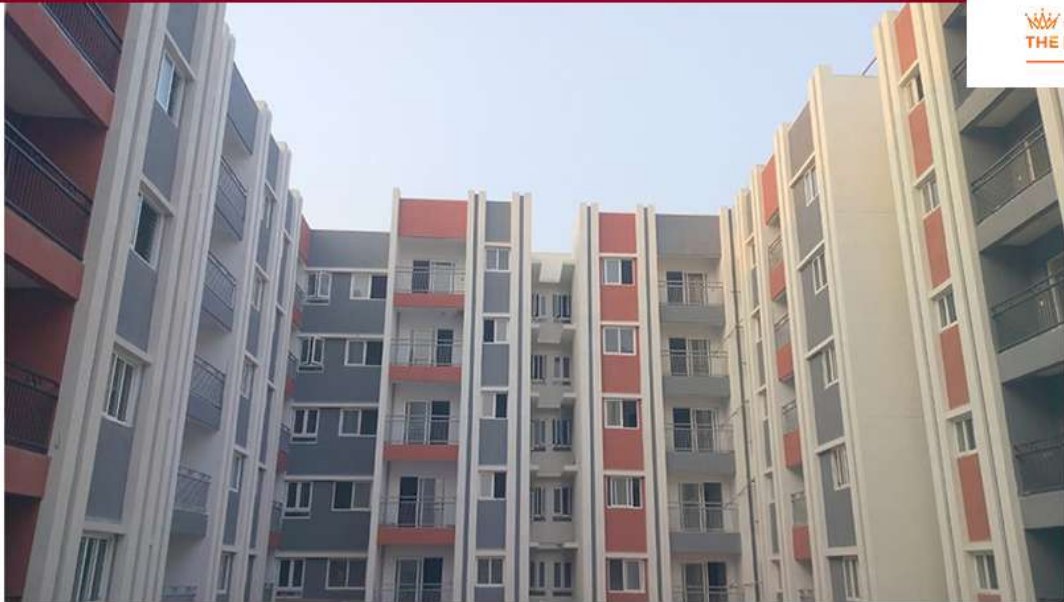
Elevation Block 1 Podium