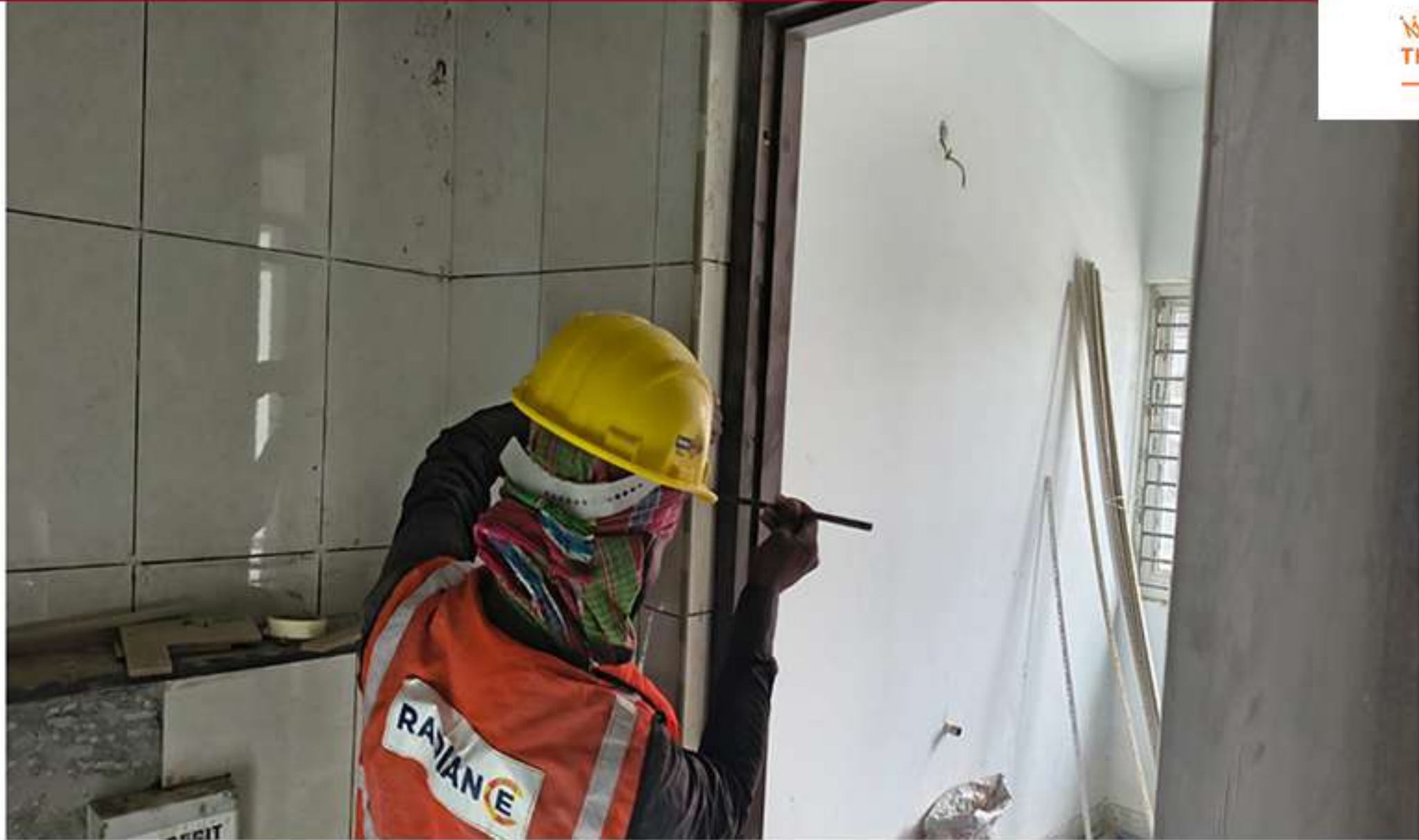
Block 1 –Cluster A Tile Jams Work in Progress