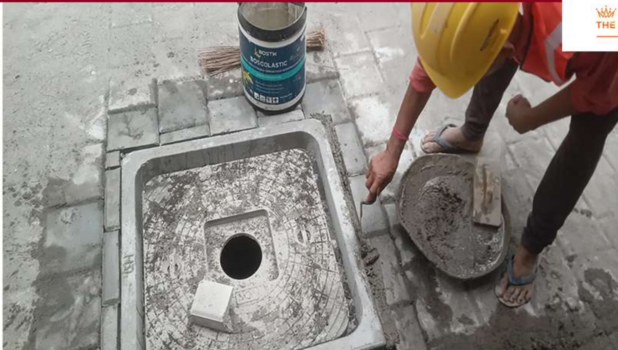
External Driveway Manhole Cover Fixing Work In Progress